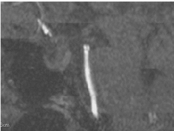
Fig. 3. Magnetic resonance angiography three months later - full recovery of the lumen of the basilar artery.

Cerebrospinal fluid examination was consistent with subarachnoid haemorrhage. There was no evidence of thrombocytopenia or other coagulopathy, on laboratory bloodtesting. A conservative treatment with analgesics and anti-hypertensive drugs was carried out. A complete resolution of the clinical symptoms occurs over a period of 30 days. There was no recurrent haemorrhage. On a follow-up magnetic resonance angiography three months later, a complete resolution of the intramural haematoma in the wall of the basilar artery was demonstrated (Fig. 3).