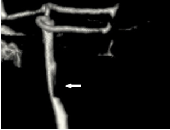
Fig. 2. Magnetic resonance angiography - an irregular narrowing of the lumen of the basilar artery. The outline of the vessel is interrupted by intramural haematoma.

On magnetic resonance imaging, and on magnetic resonance angiography, an irregular narrowing of the lumen of the basilar artery was disclosed due to intramural haematoma in the wall of the artery (Fig.2).