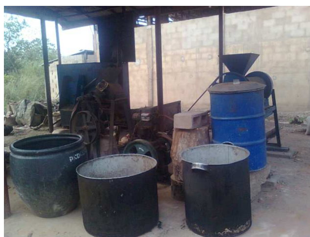
Figure 2. Oil palm processing equipment.

Among the palm processing techniques, about 15% of the processors used modernized hand presses while 75% still uses the primitive processing equipment for their production (Figure 2).