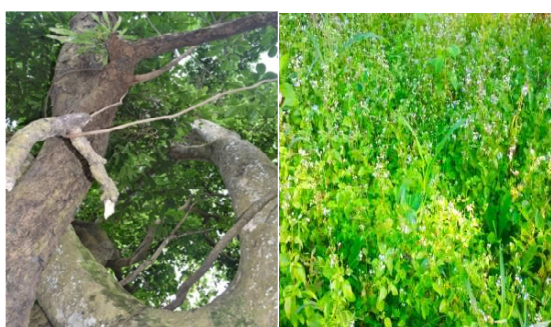
Figure 9. The Da-o tree and other species.