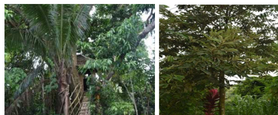
Figure 3. Tree House. The tree with almost 1.1 meters width at Helen's Haven Eco Park and Resort, Barangay Libod, Tigaon, Camarines Sur.