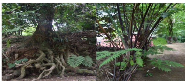
Figure 7. Sample ferns in the vicinity.