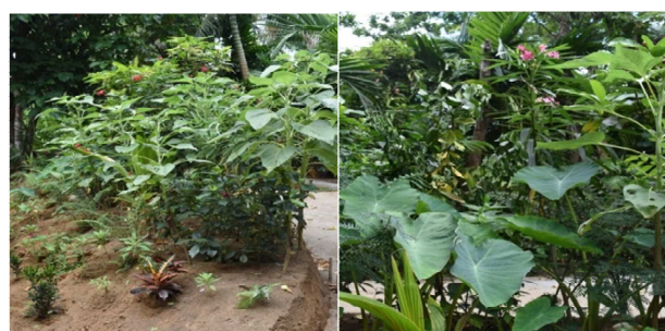
Figure 8. Sample vegetable plantation.