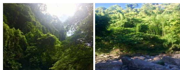
Figure 4. Hillsides and hillslope going to Canibag Falls.