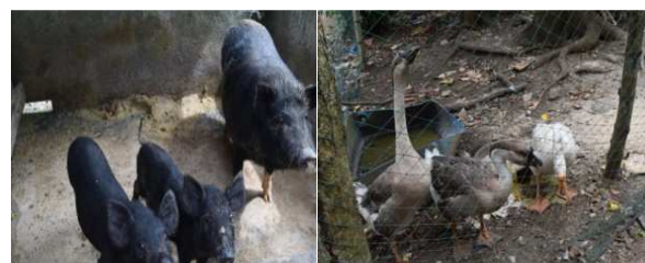
Figure 10. The wild pig and geese.