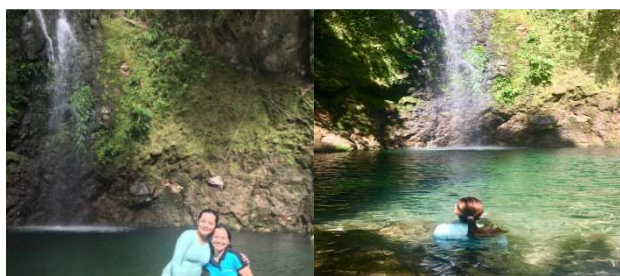
Figure 5. The Canibag falls is a like bag shape can be found in the mountaineous area adjacent to Mt. Isarog Protected Area at Libod, Tigaon, Camarines Sur.