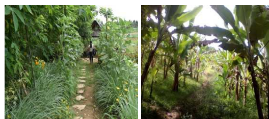
Figure 2. VK Farm and Sanoy Farm.

Aside from the infrastructures that will enhance the area, such as widening of roads, creation of alternative route going to Canibag falls in times of change in weather conditions and other infra projects. This will also respond to Sustainable Development Goals-journey 2030 promoting local and green purchase food/agricultural local supplies and fair trades, host community involvement [25] and maximizing the benefits that derive from agriculture and tourism [26].