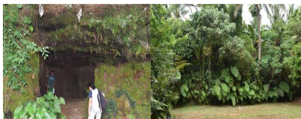
Figure 6. A man-made cave. This is located inside the Helen's Haven Eco-Park and Resort. It is unique in nature where tourist will enjoy the difference from the natural-based cave.