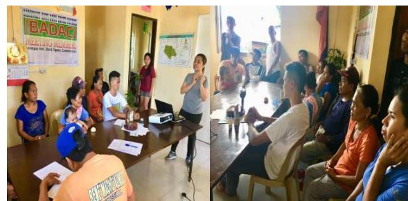
Figure 11. During the focus group discussion.