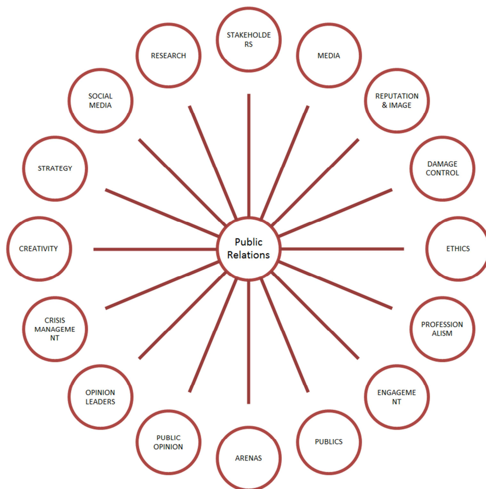
Figure 2. Conceptualization of Public Relations Issues.

We were fascinated by how giant MNCs handle major crises affecting their reputation and image, and the amount of compensation they have to pay as well as the Corporate Social Responsibility they do to redeem their image. This is an area for further research [10, 11, 13, 22, 24, 27]