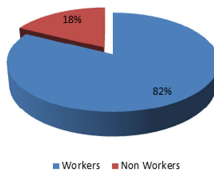
Fig. 1. Targeted Population for DE Programmes.

A PERCENTAGE PIE CHART SHOWING TARGETED INDIVIDUALS FOR DISTANCES EDUCATION PROGRAMME