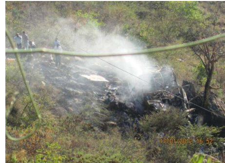
Figure 1.1. Sample situations of traffic accidents in Ethiopia