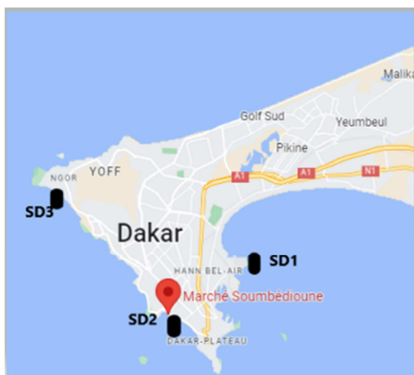
Figure 1. Location of sampling points in the Dakar coast (Senegal).

The studied stations Ngor, Hann and Soumbédioune border the Atlantic Ocean and they are seats of many activities (Figure 1). The Hann bay (SD1) is home to fishing activities, textile mills, fish processing plants and sewage from the eastern canal. The Soumbédioune beach (SD2) is a landing place for fish products and receives wastewater from the west channel (open channel IV) which passes a good part through the communes of Dakar. Ngor (SD3) bay is a tourist site is traversed by an open channel crosses the most part of this communes.