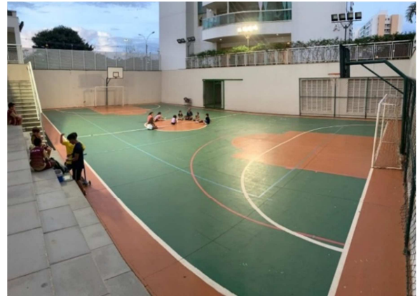
Figure 2. Sports court.

The photographic report presents a complex of buildings of recent construction, with a high standard of finishing and an efficient maintenance system. The condominium has several leisure facilities, such as a heated indoor pool, an outdoor pool, a sand court, a sports court, a children's playground, a square and a walking trail inside the property. Only a few photographs were selected to demonstrate the available equipment.