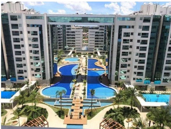
Figure 6. Aerial view of leisure area.