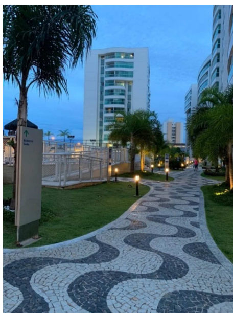
Figure 1. View from inside the condominium.