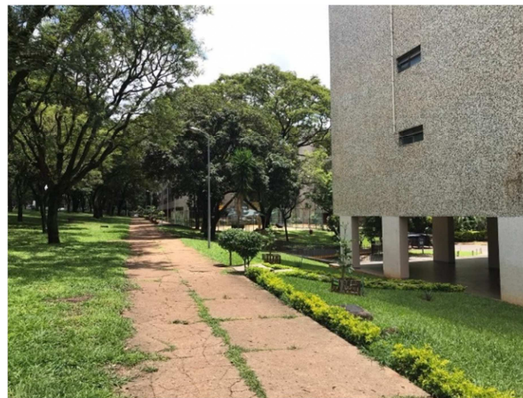
Figure 10. Court sidewalk with signs of deterioration.