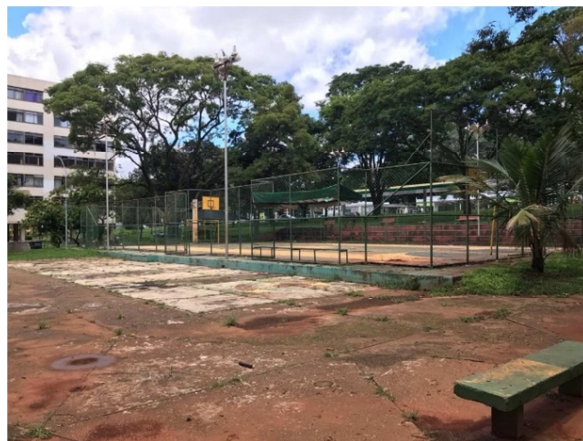
Figure 8. Sports court.

The photographs of SQN 113 shows a block with buildings requiring maintenance, in addition, the common and leisure areas are also in a precarious state for the use and circulation of people. The sports court, for example figure 10, is in very bad condition, with its surroundings totally damaged. On the sidewalks, figure 12, presents a cracked and irregular floor, inappropriate, especially for people with limited mobility or people with special needs.