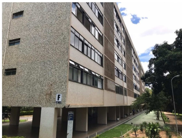
Figure 9. Facade of one of the buildings on the block.