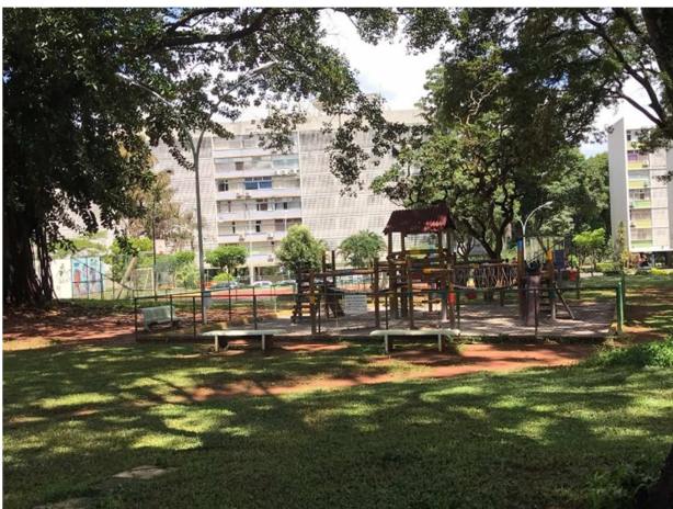
Figure 12. Playground inside SQS 113.