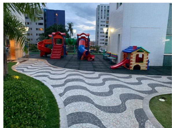
Figure 4. Playground.