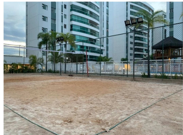
Figure 3. Sand court.