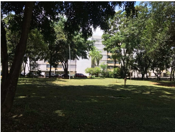
Figure 11. Green area at SQS 113 with residential building in the background.

Figures 11 and 12 illustrates the statements above, it is possible to observe many trees, a large lawn and a facade of a residential building in good condition. The instant the pictures were taken, in figure 12 it is possible to see children from a public school located on the same block developing recreational activities. Also noteworthy is the absence of people walking along the roads or enjoying the abundant shadows that the trees provides. The number of vehicles parked shows the condition of a road city, with the priority given to the car.