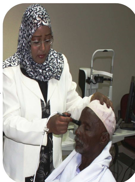
Fig. 5 (a, b). B-scan. Posterior segment evaluation; Nidek US-4000 EchoScan.