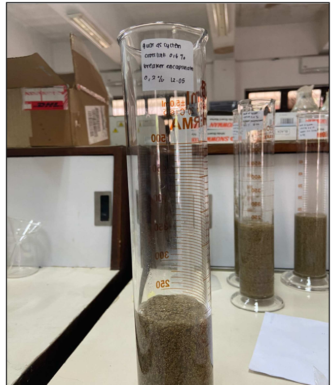
Figure 5. Proppant carrying performance of fracturing fluid.