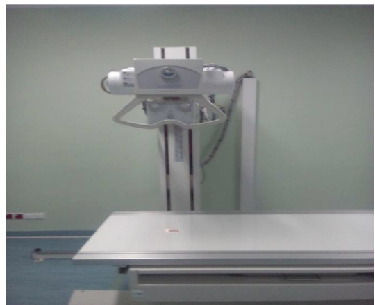
Figure 1. Experimental setup for the determination of Da and K air .

To determine the dose in air, the load is fixed but by varying the high voltage for a given distance between the source and the thermoluminescent dosimeter. This distance was set at 100 cm. For kerma in air, we set the high voltage and we vary the charge.