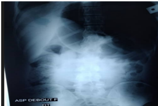
Figure 1. X-ray of the abdomen showing a gaseous hyperclarity.