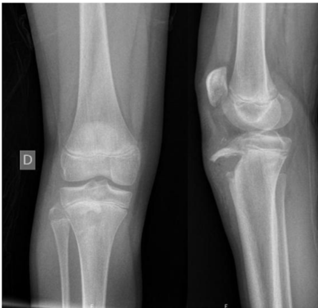
Figure 1. Initial AP and lateral X-rays of the right knee of our patient. The tibial tubercle fracture is evident in the lateral views, however the patellar fracture is barely visible.

Radiographs of the knee (Figure 1) showed an avulsion fracture from the tibial tuberosity with the bony component drawn proximally. The tibial tubercle avulsion was described as being a Watson-Jones type 2 [4] (Ogden IIB [5]) (Table 1), while the distal patellar lesion was characterized as a sleeve-like fracture.