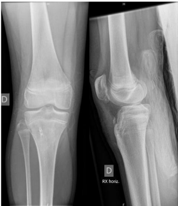
Figure 4. AP and lateral X-rays after the hardware removal showing consolidation of the fractures.

We want to stress the absence leg length discrepancy or recurvatum deformity (growth arrest anteriorly and continues