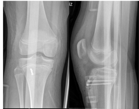
Figure 2. Immediate postoperative AP and lateral X-ray. Surgical fixation with cannulated screws of the tibial tubercle avulsion fracture is evident.

Anatomic reduction was achieved under direct visualization and fixation was assured by 2 cannulated screws of 4.0 mm with a washer (Asnis III, Stryker, Selzach, Switzerland) (Figure 2). The patellar fracture did not involve the distal pole in its entirety, consequently we let it heal without any surgical interference, with good results.