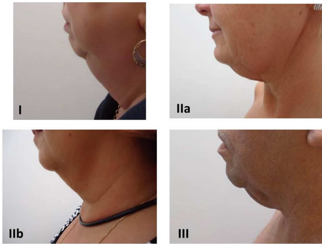
Figure 3. Grades of Neck Contour Deformities after Massive Weight Loss.

And platysmal laxity and bands were classified as Grade III (Figure 3).