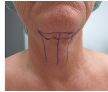
Figure 1. Submental Neck Lift: Preoperative markings of the elliptical skin resection area.

All patients received a tumescent anesthesia. An incision was made direct under the horizontal skin fold of the chin and preplatysmal preparation extended down the central neck. The platysma was addressed, bands resected and fat pads removed followed by a midline platysma corset plication as described before [16-19] to restore the cervicomenal angle. The skin was draped over the resulted neckline and excess tail tucked tension free under the chin with an elliptical skin excision.