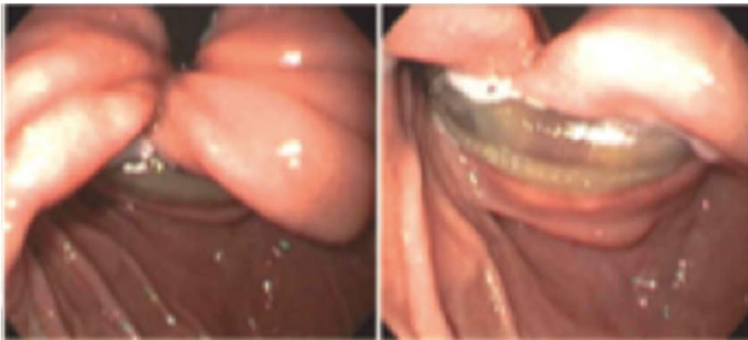
Figure 1. Endoscopic view showing gastric wall erosion secondary to gastric band device.

The diagnosis of a LASGB-related complication is facilitated by ancillary studies including upper gastrointestinal contrast series, computed tomography scan, and upper endoscopy, the later providing the highest sensitivity of all [2, 3, 13]. A pathognomonic finding in an upper gastrointestinal contrast study is visualization of the band as an intraluminal-filling defect. Nevertheless, this finding only occurs when at least 50% of the band has already migrated into the gastric cavity. An upper endoscopy with a retroflexed view allows direct visualization potentially eroded segments just below the gastroesophageal junction. Endoscopically, the erosion can be classified in 3 stages: Stage 1: a small part of the band is visible through a mucosal defect; Stage 2: more than half of the band has migrated in to the gastric cavity; and Stage 3: complete intragastric migration of the band. An upper GI endoscopy was routinely performed in all of our patients and demonstrated that the silicone band had perforated the stomach in three patients (Figures 1).