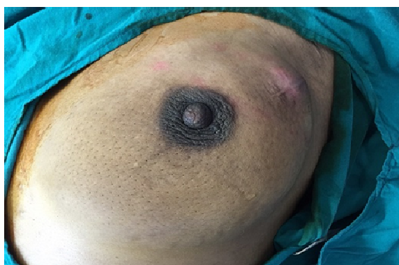
Fig. 1. Preoperative left breast cancer in upper outer quadrant.

Evaluation of aesthetic results (Figs 1-6) by patients revealed that 30 patients (75%) were deeply satisfied, 6 patients (15%) were satisfied and 4 patients (10%) were poorly satisfied. While, surgeon aesthetic evaluation was good in 28 patients (70%), satisfactory in 8 patients (20%) and fair in 4 patients (10%) as shown in table 3.