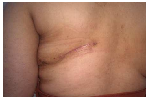
Fig. 6. Postoperative appearance of back scar.