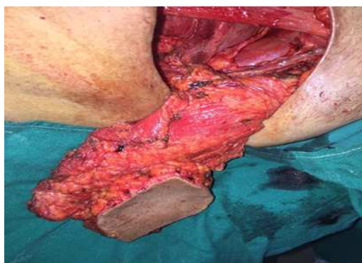
Fig. 3. Left LD flap moved to the site of partial mastectomy.