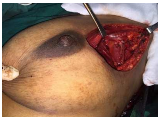
Fig. 2. Complete resection of the lesion with 2cm safety margin all around and complete axillary LN dissection.