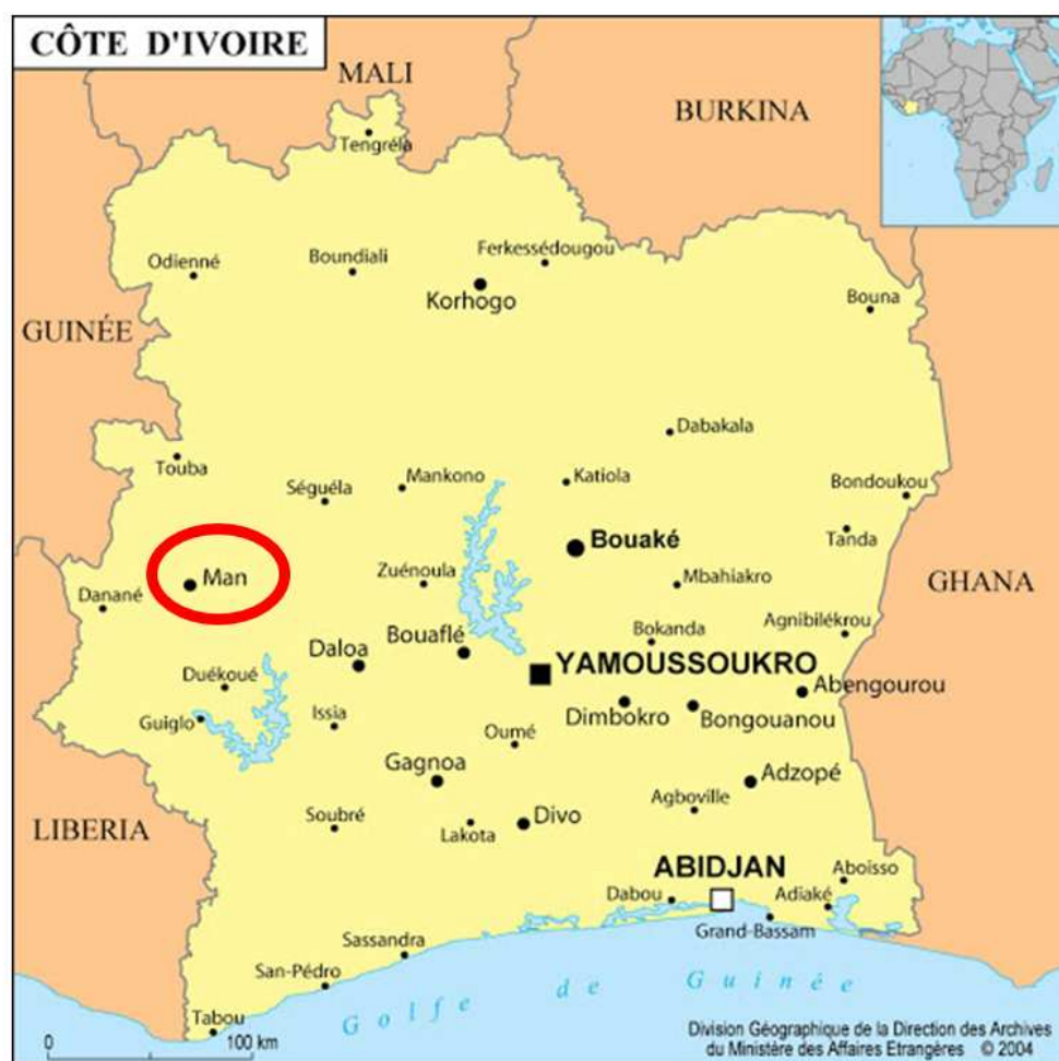
Figure 1. Geographical location of the city of Man.

This study was conducted in the town of Man. The city of Man is located in the west of Côte d'Ivoire, at latitude 7° 24' North and longitude 7° 33' West. This city is bounded to the north and west by the city of Biankouman and Danané, to the south by Bangolo (Figure 1). It is a mountainous and forested area with a mountain climate, a long rainy season and a short dry season favoring the formation of dense forest.