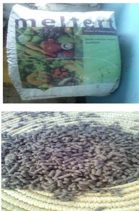
Figure 1. Pictorial representation of Melfert product.

On the other hand, SeaMel pure has been reported as one of the purest refined seaweeds extract, where only natural processes and forces are used to refine these extracts. The product is shown to ensure strong root development and rapid absorption of macro- and micronutrients. Furthermore, the product is reported to enhance the efficacy of foliar and fertigation feeds and results in better crop quality and higher yield (Melspring International B. V. PLC). Moreover, it is believed that the product is easy to use, and safe for people and environment (Melspring International B. V. PLC). Hence, it is important to evaluate the importance of Melfert and SeaMel pure fertilizers for the seed cotton yield improvement under irrigated condition in middle Awash Valley of Ethiopia.