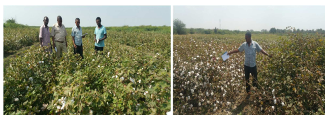
Figure 3. Field performance evaluation of Cotton crop.

The mean seed cotton yield was significantly influenced by the application of Melfert organic fertilizer alone and integrated with recommended N (Table 3). Application of 1 t ha -1 Melfert organic fertilizer alone (2.86 t ha -1 ) or combined with recommended N (46 kg N ha -1 ) (2.91 t ha -1 ) or with one-third of the recommended N (2.87 t ha -1 ) produced significantly higher seed cotton yield ( p < 0.05 ) (Figure 3) as compared to the existing production practice that recommends 46 kg ha -1 N (2.64 t ha -1 ; Table 3).