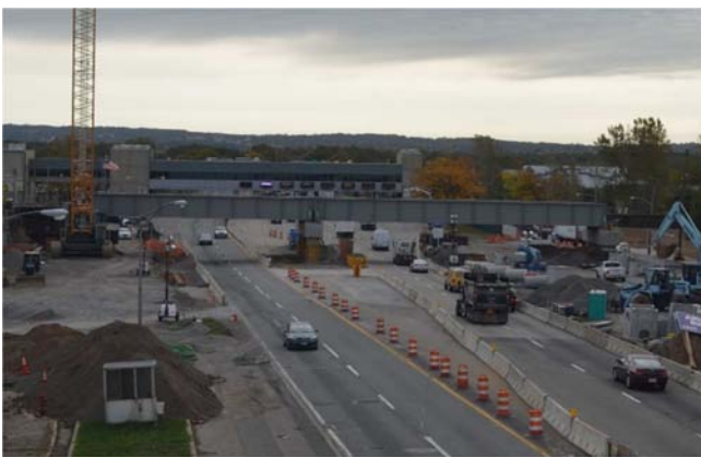
Figure 1. New Travis Spur Rail Bridge after the replacement weekend.

To accommodate higher traffic volumes, the New Goethals Bridge is two times wider than the existing one. However, the concrete piers of the existing TSR Bridge would constrain the width of the access roads to and from the New Goethals Bridge. Therefore, the goal of the TSR Bridge replacement project was the removal of both the existing substructure and superstructure and the replacement with an entirely new structure that would allow the desired road widening, as shown in Figure 1. For the accomplishment of the first objective, the demolition of five existing steel spans (2 main spans), four concrete piers and two concrete abutments was required, while for the second one, ten drilled shafts, a new abutment and two piers, three new cap beams and two steel spans were constructed. Since the main objective of the replacement was not the structural or seismic upgrade of the existing structure, the materials and bridge structural system were not modified. The new bridge, however, has slightly longer spans compared to the existing one and is designed according to current standards.