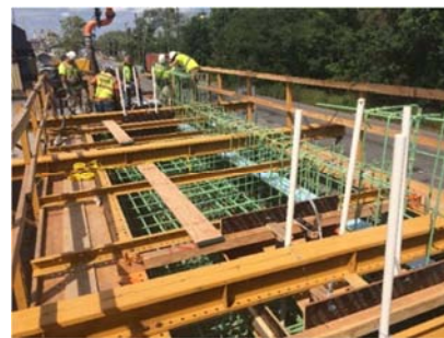
Figure 13. Casting of the cap beam using a pump truck.

As soon as the concrete placement on each cap beam was completed, a retarder was added to the surface of the future pedestal, which allowed the use of power wash for the completion of the joint preparation instead of bush hammering, a method which was also used on the north abutment backwall.