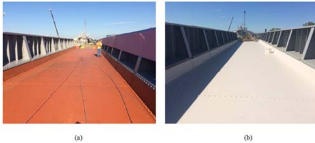
Figure 16. Waterproofing works on top of span 2: (a) primer coat, and (b) finish coat.

SSPC-SP 10. Then, a primer coat was applied to all blasted surfaces (Figure 16a). Afterwards, a cold “Eliminator” waterproofing membrane was applied twice to get the desired thickness (Figure 16b). The procedure schedule was dictated by the steel temperature and was often performed during early evening. Finally, the touch up painting of the bolted connections and any scratches occurred during installation was accomplished over approximately one month.