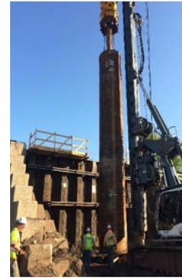
Figure 4. Aligning twister attachment into slots.

During the drilling process, the excavating bucket was used to remove the soil from the casing, leaving approximately 1.52 m (5 ft) of soil at the bottom as a plug until contact between casing and rock was achieved. The casing was then flooded with water and the remaining soil was removed. Drilling of the rock was relatively easy and a combination of excavating bucket and core barrel were used to drill the 1.68 m (5.5 ft) diameter rock socket. Each rock socket had a minimum depth of 2 times the diameter. For the TSR Bridge shafts, air lifting was not possible because of large distance from a water treatment plant and the possibility of a pipe failure over live traffic. It was decided to use the cleanout bucket and weld a plate on the bottom to assist the collection of fine material from the shaft bottom. To get acceptance of the shaft (i.e. that the shaft bottom was sufficiently clean to pour concrete), a Shaft Inspection Device (SID) [10, 11] test was performed.