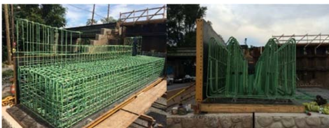
Figure 11. Tied on soffit rebar.

To support the rebar cage load on the elevated soffit in the temporary location, 3 posts were installed along the unbraced side of the form. Half of the soffit was supported on the long steel form spanning the entire cap length, while the other half was supported on these posts. Since positioning of the long horizontal bars on the formwork bottom was obstructed by the template (Figure 11), the couplers were dismantled and the cage rite was cut so that rebar and stirrups could be accurately placed. After tying together the reinforcement cage the forms were closed up and a walkway was installed around the top to provide access for pedestal work and casting (Figure 12).