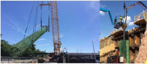
Figure 5. Transportation of the rebar cage with picking ring (left) and placing tremie with pump truck (right).

Logging (CSL) tests [12] were conducted and three days after shaft placement, the concrete quality was verified. Once the results were approved, the CSL tubes were grouted and the laitance was chipped from the top of the shafts.