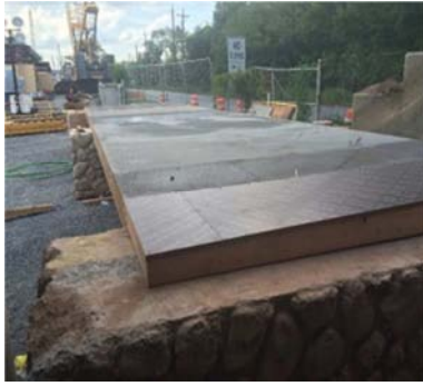
Figure 9. Soffit set on 3 supports.