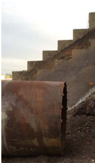
Figure 2. Teeth welded on casing.

After examination of various alternatives for the foundation system of the new RC piers, the engineering teams opted for the solution of drilled shafts rather than massive footings, as the shaft footprint is rather small, while reuse of the existing foundation members [9] was not possible. This choice minimizes the disturbance to the existing members that are in proximity. On the same time, drilling is a much faster process compared to works associated with excavation, provisional soil retaining and footing formwork. After the completion of excavation works at both north and south abutments, the drilled shaft construction commenced. In total, ten shafts were drilled for the new rail bridge, each measuring 1.83 m (6 ft) in diameter. With regard to the casing geometry, a wall thickness of 19 mm ( \frac{3}{4} " ) and length varying from 10.36 m (34 ft) to 12.80 m (42 ft) were selected. Cutting teeth were welded on the casing bottom and a 0.3 m (1 ft) driving band of 19 mm ( \frac{3}{4} " ) thickness was positioned around the top of each casing (Figure 2). When the equipment was brought to the field, 2 holes were cut in the casing top in order to fit a shackle. In addition four twister slots were cut around the top of the casing. A device was fabricated and attached to the drill rig to guarantee that all four twister slots would work together during the drilling process and to ensure that no shearing would occur under the applied load.