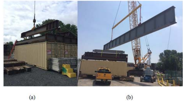
Figure 14. (a) Grillage steel positioning on connex box, and (b) setting of the first girder for span 2.

After the first girder was positioned and secured, the deck panels were set and fastened to the girder. Each deck panel consisted of 4 floor beams running perpendicular to the span length and a welded deck plate. Each floor beam was bolted to the girder's stiffener. To minimize the risk of fall during installation, a lifeline was placed along the girder's top so that the crew members could tie off during the operation. During the positioning process, the beams had to be shimmed to the shoring towers in order to keep the camber and allow the bolts to fit up. In order to release the initial girder bracing, 4 floor beams had to be 100% bolted (2 on either side of the centerline of the girder). After the girder bracing removal, the second girder was set in a similar manner to the first one, with only exception the fact the second girder had to be fixed to each floor beam prior to setting down (Figure 15a).