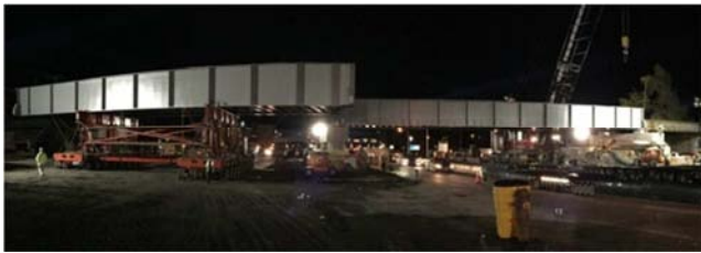
Figure 20. Rolling Span 1 on north abutment and north pier cap beams using SPMTs.

After the traffic switch, the anchor bolt sleeves in the north and south piers were grouted and the four new bearings were set on the north pier and north abutment to support the next span. The welding of the bearings under span 2 was also performed at this stage. The DGA ramp and road plates were then rebuilt on the I-278 westbound lanes in the same way as previously completed on the eastbound lanes. Afterwards, once the new span was fastened tightly, the shoring boxes were removed, and the SPMTs rolled the new span into its final location (Figure 20). Then, the SPMTs staged out of the way and the roadway was cleaned up and restored normal traffic flow in both eastbound and westbound directions.