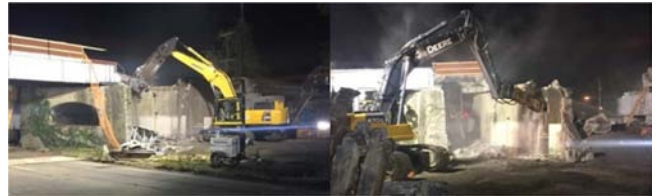
Figure 19. Demolition process: Shearing down the existing TSR Bridge deck (left) and Hammering out the existing abutments (right).

piers (Figure 19), and one excavator with grapple and one loader being used to load out steel material into container trucks that would be directed to the scrap yard. Concrete debris was loaded into dump trucks and directed to the main Goethals Bridge project site for later testing. At the same time, DGA was being transferred from the satellite yard, spread to the I-278 eastbound lanes and then compacted to reach the yard height (range between 0.30 m and 0.91 m) and then gradually sloped down to the elevation of the roadway to create a path for the SPMTs.