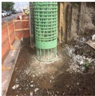
Figure 6. Rebar on top of the shaft.

The new bridge was supported on 6 piers, measuring 1.68 m (5.5 ft) in diameter in order to fit to the drilled shaft diameter (see Section above). This choice resulted in rebar installation during the shaft operations (Figure 6), the remaining work for the piers being the touch up of the epoxy paint coating and the installation of a plywood shoe and EFCO type formworks [13] (Figure 7).