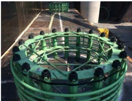
Figure 10. Rebar hoops placed around the couplers.

To support the rebar cage load on the elevated soffit in the temporary location, 3 posts were installed along the unbraced side of the form. Half of the soffit was supported on the long steel form spanning the entire cap length, while the other half was supported on these posts. Since positioning of the long horizontal bars on the formwork bottom was obstructed by the template (Figure 11), the couplers were dismantled and the cage rite was cut so that rebar and stirrups could be accurately placed. After tying together the reinforcement cage the forms were closed up and a walkway was installed around the top to provide access for pedestal work and casting (Figure 12).