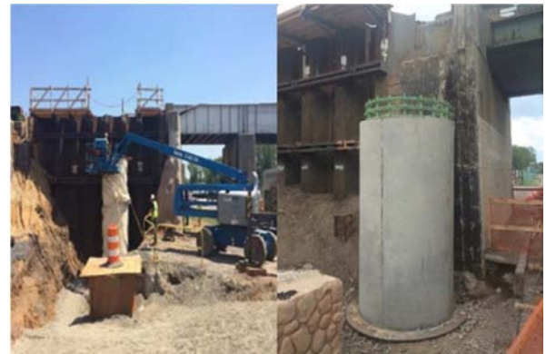
Figure 8. Wrapped forms for concrete thermal control (left) and completed pier (right).

brought to the site from EFCO [13], so that works would proceed simultaneously for all piers. Once the thermal cure period (7 days) passed, the formworks were removed. The work following the formwork removal was the joint preparation on top of the piers. This included bush hammering of the pier top in order to expose the aggregates and clean off any loose concrete. The exposed part of the rebar cage was again touched up with epoxy (Figure 8) and the exact center of each bar was surveyed.