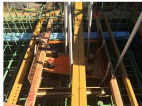
Figure 12. Pedestal forms with anchor bolt sleeves.

beam and the pier. Each pier location received 4 38.1 mm (1.5") sleeves to make sure the entire area would be covered with grout. To control the concrete placement, a pump truck was used (Figure 13). The location of each PVC sleeve was marked, allowing the constructors to track the exact sleeve locations and prevent sleeve-vibrator contact resulting in sleeve damage. Verticality during pouring was guaranteed by a rebar passing through each sleeve. Once the cap beam was casted, a 4% wash was finished on the top. The smaller pedestals (76.2 mm or less) were constructed monolithically during grout pouring, while the larger ones were poured the following day.