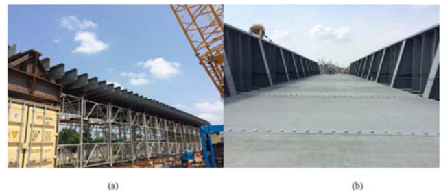
Figure 15. (a) Floor beams before receiving second girder, and (b) view of span 2 with all knee braces installed.

Once both girders and all the floor beams were set and bolted, the knee braces were placed (Figure 15b). The knee brace spacing corresponded to the distance between four floor beams and was connected to the girder and deck panels using bolts that were fixed tightly and inspected. Afterwards, the side and curb plates were installed in the same way. Prior to their rigid fixation to the existing structure, the shoring below the new span was removed in order to facilitate the access to the workers for bolting up.