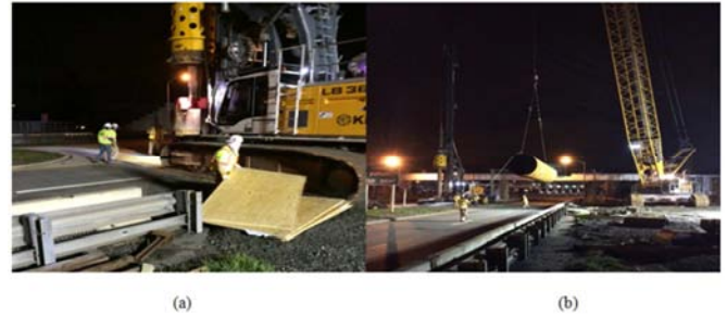
Figure 3. (a) Mobilizing the drill to median and (b) Casing transportation over I-278 WB to the median strip).

All ten shafts were installed by the LB-36 drill rig shown in Figure 3. The crane had to move at off-peak traffic times in order the traffic flow to be maintained on I-278. In order to provide access for the drill rig, the existing wing walls had to be demolished, adding extra time and cost to the operation. The shafts of the north pier were positioned first (median strip of I-278 - Figure 3b). The LB-36 drill rig and an 895 crane were used for this operation during a graveyard shift. The casing was relocated by the drill and the twister slots were engaged. The casing was then spun into the ground at the correct location (Figure 4).