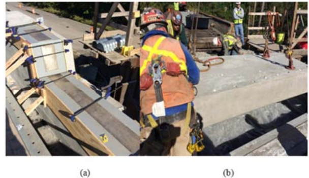
Figure 21. (a) Bent plate grouted into the backwall, and (b) Placing the approach slab on the backwall studs.

was installed and rotated. Finally, waterproofing, and floor drain was installed.