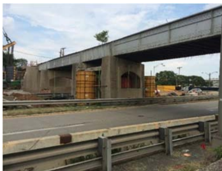
Figure 7. Formwork set around the rebar cage.

The twin piers at the north abutment were placed using the 40 ton crane, while the remaining 4 piers were placed in sets of two using the 322 excavator and concrete bucket acted. The formworks were wrapped in concrete blankets prior to concreting and thermal sensors were set in the middle to monitor the cure period (Figure 8). It must be noted that due to the schedule and sequence of work, 6 formworks were