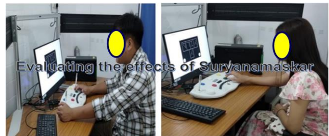
Figure 1. VTS Cognitrone Test Form S4 for Data Collection.

Figure 1: VTS Cognitrone Test Form S4 for Data Collection test.