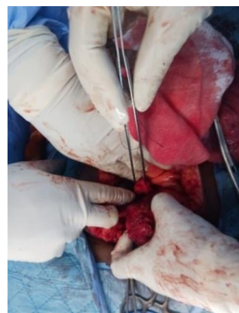
Figure 3. Uterine breach of isthmic seat after disincarceration of the ileal loop.

The diagnosis of acute intestinal obstruction was retained and an emergency laparotomy was indicated. The incision was median. Intraoperatively, we noted an ileal loop incarceration 60cm from the ileo-caecal junction through a 3cm myomectomy defect located posteriorly on the isthmus. The defect was 4cm deep and 3.44cm in diameter. The incarcerated ileum was