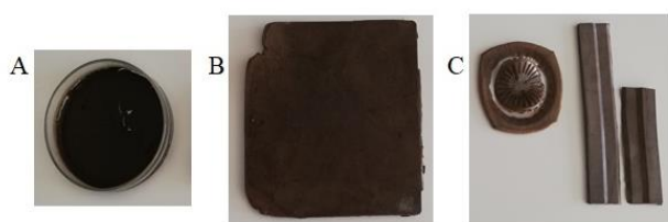
Figure 1. A: Sample of rubber produced from T. officinale , B: The state of the produced rubber after vulcanization C: Rubber samples after molding.

After the paste reached the desired consistence, it was taken into hot press machine and vulcanization was performed in the press die (140 °C, 7 minutes) [25, 26]. The produced rubber was molded by pouring it into several different molds and given simple shapes (Figure 1). If a product is to be produced, various materials can be added at this stage or thereafter to give the desired shapes according to the area of use.