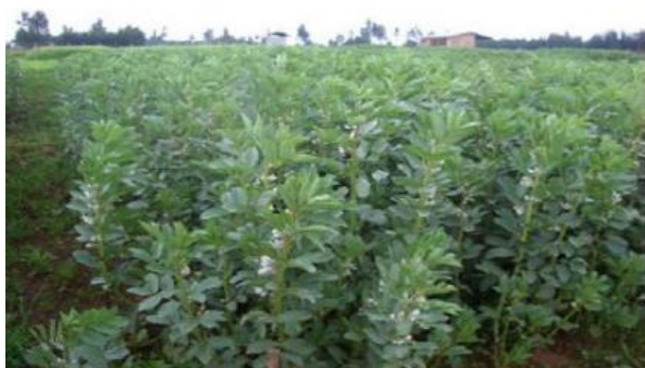
Figure 3. Faba bean development on acidic soils in limed circumstance source: [66].

When acidic soils are limed, the pH of the soil is raised, releasing phosphate ions that precipitate with Al and Fe ions and facilitating plant uptake of P [73, 26, 67]. Agegnehu [68] reported that the growth of faba beans under limed and unlimed circumstances on acidic soils in Welmera, Woreda, Ethiopia, illustrates the considerable influence of lime on crops (figures 3 and 4, respectively).