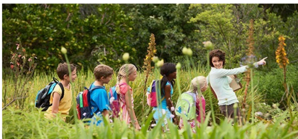
Figure 1. Showing school children on field trip.

generally willing to use field trip as part of their pedagogy because they feel that their students need hands-on, real life experience to examine the application of science which arranged their classroom studies. The taking of youths to parks, schools, camps, nature centers and other outdoor settings provide an important contribution to the learning process as shown below.