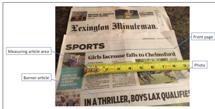
Figure 1. Data Extraction from the Lexington Minuteman .

(present/absent), and layout area for each article (in square centimeters). A standard ruler was used to measure the area covered for each article including its corresponding title. Figure 1 illustrates how data was extracted from the Lexington Minuteman newspaper.