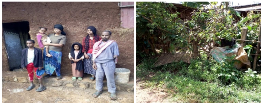
Figure 1. Disabled family and their house before.

Therefore, based on the above information we were thought to solve these problem through easy way: when we have seen this family problem it was very boring because this disabled person didn't do any more to accelerate his livelihood. So job which he can do with his capacity and can improve his life was rearing of a day old chicken. Through creating this job opportunity the rest problem would be solved by this disabled family. Then of these above problem the 1 st and 2 nd were been solved and the others may be solved through vertical vegetable planting we were showed also.