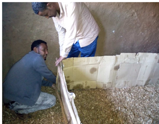
Figure 2. Safeguard.

In places without access to electricity, Figure 2 depicts substitute brooding spaces made from locally obtainable materials, which are utilized to take the role of the natural brooding hen. When using locally manufactured brooders, it's important to make sure the chicks can travel toward or away from a heat source and are at the proper temperature. An area that is comfy is crucial for a day-old chicken.