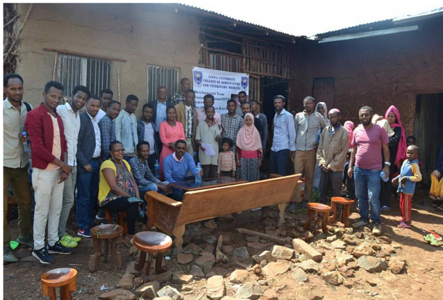
Figure 10. During hand over time.

After all the activities carried out by the DTTP group eleven students with the help of residents of the area, the handover was celebrated. In the handover ceremony the Jimma university college of agriculture and veterinary medicine community based education coordinator, the DTTP group eleven students, the respected personnel from Bacho Bore kebele and Jimma town livestock and fishery resource development office and as well as the residents of Jimma town or Bacho Bore Kebele were participated. The ceremony in the form of pictures looked like the following.