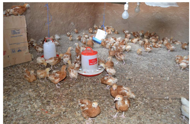
Figure 8. Current status of chicken.