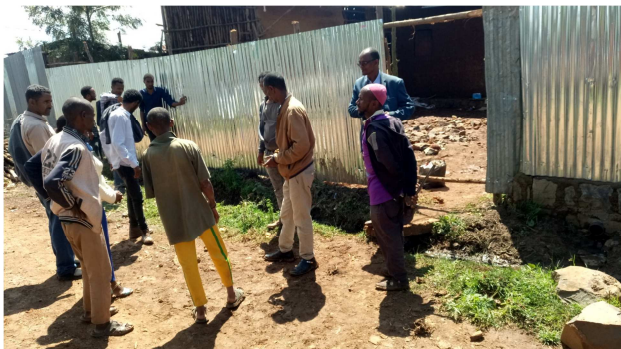
Figure 5. Constructed fence.

For the successive of this project or control mechanism of predators; the chicken house need fence. Based on this we were did fence around day old chicken of selected area. The predators which exist here were dog and another's may exist.