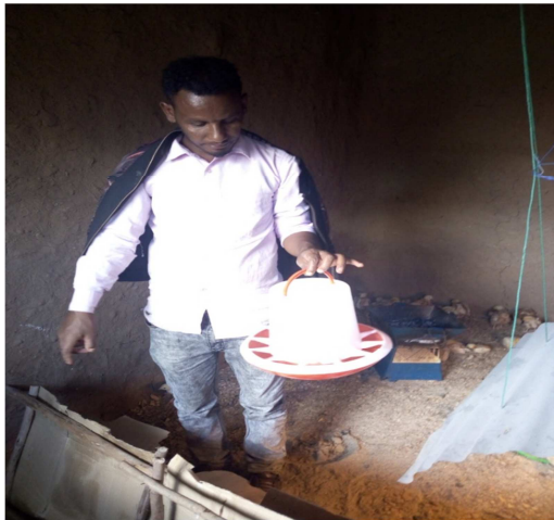
Figure 4. Feed trough.