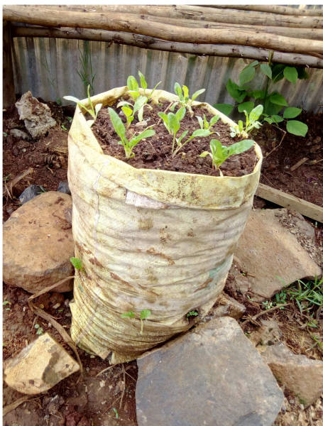
Figure 7. Vertical and sack vegetable.