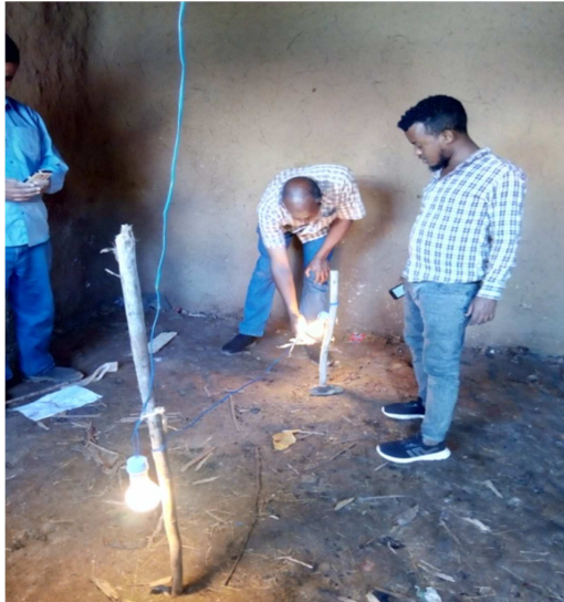
Figure 3. Light.