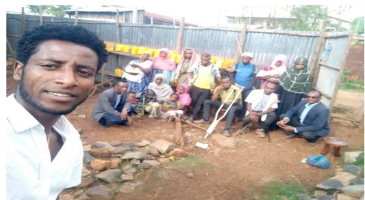
Figure 9. Training another disabled group and community based on this model project.