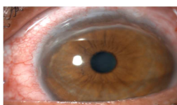
Figure 2. Superior crescent-shaped corneal ulcer with limbal involvement but no associated scleritis, and with fluorescein stain positive.

Systemic evaluation for underlying diseases causing peripheral ulcerative keratitis included: Complete Blood Count (CBC), complete Metabolic Profile (CMP), urinalysis with microscopic analysis, infectious serology, angiotensin converting enzyme (ACE), X-ray chest and joints, accessory salivary gland biopsies and autoimmune screenings (for rheumatoid factor, antinuclear antibody, anti-neutrophil cytoplasmic antibody and anti-DNA antibody).