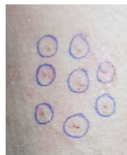
Figure 6. Negative pathergy test after 72 hours.

We supposed a possible diagnosis could be Behçet's disease. A further assessment was requested to confirm the diagnosis of Behçet; Pathergy test was negative (figure 6), HLA B51 was positive. And following international diagnostic criteria for Behçet's Disease, we kept the diagnosis of Behçet. Systemic therapy was started with colchicine at a dose of 2mg/day. Eye drops and systemic prednisolone at 1mg/kg/day was continued with progressive decrease.