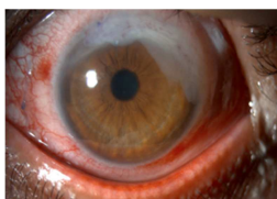
Figure 3. Amniotic membrane transplantation for the corneal ulcer in the left eye

The patient observed an increased pain and redness in both eyes. The slit-lamp examination revealed a deep corneal ulcer. Amniotic membrane transplantation with conjunctival resection was done in the area of melt were done in both eyes (to fill the corneal defect and to promote the corneal cicatrization) (figure 3, 4).