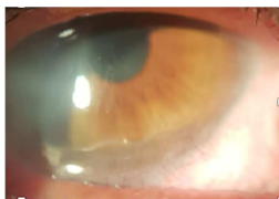
Figure 1. Inferior crescent-shaped corneal ulcer with limbal involvement but no associated scleritis.

both eyes, there was no sign of corneal infection (purulent secretions or infiltrates), corneal sensitivity was preserved. A tear film study demonstrated decreased Schirmer test results (5mm in both eyes) and tear film break-up time (5 sec in both eyes). There was no inflammatory reaction in the anterior chamber and no signs of retinal vasculitis.