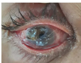
Figure 4. Amniotic membrane transplantation overlay technique for the corneal ulcer in the right eye.

Nevertheless, the amniotic membrane was rapidly reduced without corneal reconstruction or healing and there was circumferential thinning which was progressing in both eyes (figure 5).