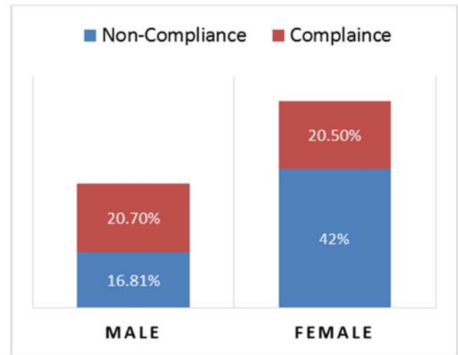
Figure 1. Compliance of spectacles among school going children.

A total of 440 children were included in this study. Out of the total 210(47%) were males and 230(52%) were females. Overall 41% children were found fully compliance with spectacle. Compliance in male children was observed greater (20.70%) than female children (20.50%)