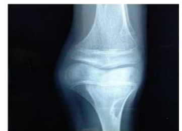
Figure 6. Bone X-ray of tea knees: showing bone hyper transparency and multiple cortical gaps.