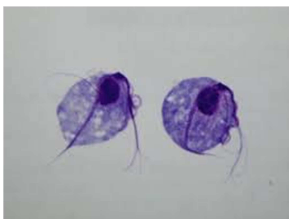
Figure 3. Trichomonas trophozoites .