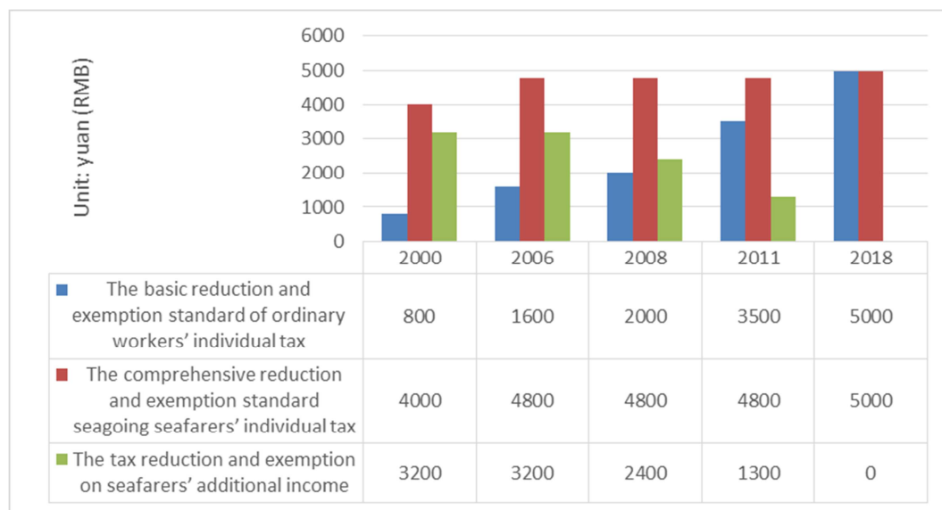
Figure 2. Comparison of individual tax reduction and exemption standards between oceangoing seafarers and ordinary workers.

China enacted the Individual Tax Law in 1980, marking the establishment of China's Individual Income Tax System. The Individual Tax Law has undergone six revisions to date. And the Individual Tax System has gone through the initial development stage (1978-1993) of parallelly internal and external tax systems, the unified and preliminary development stage (1994-2004) and the enhanced Legalization stage of individual tax (from 2005) [17].