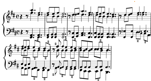
Figure 9. Cl. Debussy – “Moonlight”, adaptation for a choir, b. 8 - 15

In the Expressionism style, we can see again the leading role of the phonism in the horizontal and in the vertical plain. In the works of the Expressionist authors, sharp interval combinations have been purposefully sought (here the interval is viewed in the light of a building element of the melody, as well as of the harmony). Portrayed through these sharp interval combinations were mainly strong, painful feelings of fear, terror, despair.