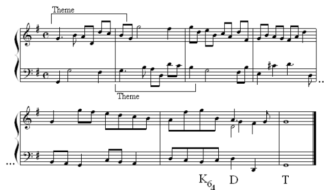
Figure 5. G. F. Handel – Fugue G dur, b. 1 – 4 and 17 – 19