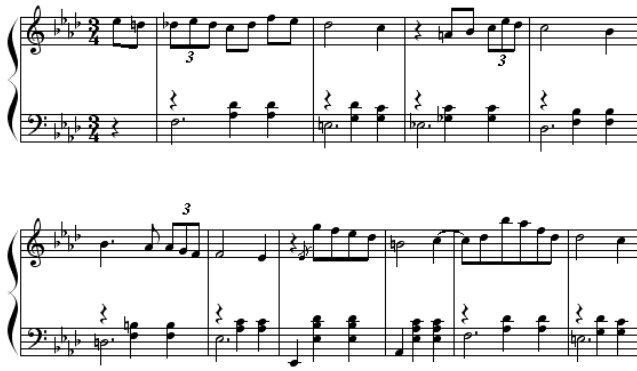
Figure 8a. F. Chopin – Waltz № 9, bars 1 - 10