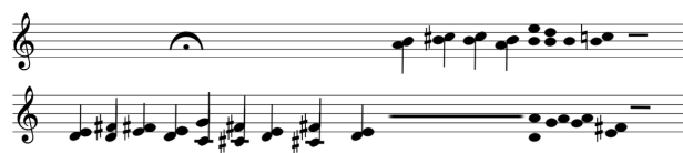
Figure 10. Iv. Spasov – “Forest charm” for a choir

Phonism and functionality as properties of the sound complex are found in a synergy or a struggle for dominance in the different styles: phonism dominated over functionality during the Baroque era, had an aligned position during the Romanticism and was established as the main form construction principle during the Impressionism, Expressionism, Dodecaphony; functionality was the main driving force for musical development in the Classicism, was in an equal position with phonism during the Romantic era, lost its position in the Impressionist era and was completely deconstructed in the dodecaphony.