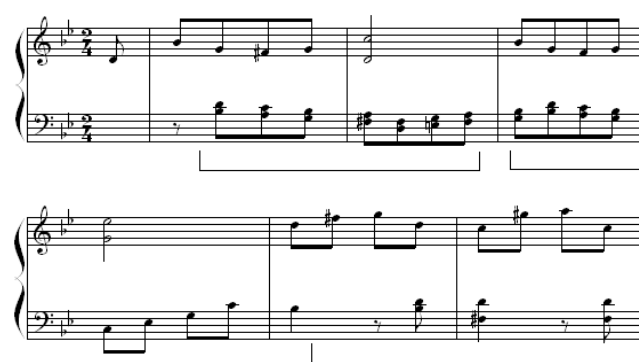
Figure 7. L. W. Beethoven – Sonata № 19, Part I, b. 1 – 6

But as the main features of the new multi-voice style – the presence of a chord accompaniment for the melody with a strictly expressed functional dependency – are defined within the frames of the polyphonic type of multi-voice texture, so in the works of the Viennese classic composers – founders of the homophonic type of multi-voice texture, individual polyphonic methods can be found with the purpose of enriching the expression: