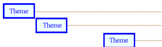
Figure 3. Polyphony, linear thinking

And so, within the frame of the polyphonic type of multi-voice texture, a new type of musical thinking – the homophonic, i.e. the vertical, slowly appeared and was established. The reasoning behind it being defined as such is based in the fact that the melody – the main bearer of musical content – is clarified functionally (the changes in its stability-instability are clarified) and it is accompanied, varied, enriched through the chords. The chord in the homophonic type of multi-voice texture is a ready construct – there are 4 types of triads, seven types of tetrads; they all have methods for application, defined by clear rules.