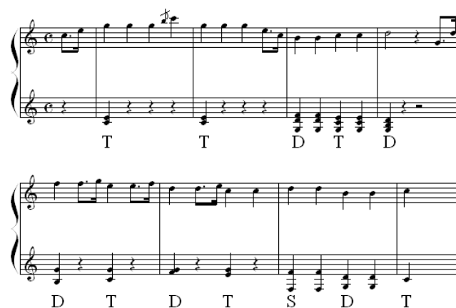
Figure 6. J. Haydn – Sonata C-dur, Part I, bars 1 – 8

But as the main features of the new multi-voice style – the presence of a chord accompaniment for the melody with a strictly expressed functional dependency – are defined within the frames of the polyphonic type of multi-voice texture, so in the works of the Viennese classic composers – founders of the homophonic type of multi-voice texture, individual polyphonic methods can be found with the purpose of enriching the expression: