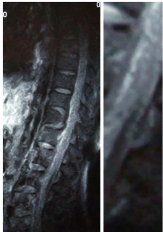
Figure 3. Dorsolumbar epiduritis with abscess opposite L3 and a posterior abnormality of the closure of the vertebral body of D11 allowing communication of D10-D11 and D11-D12 discs. The enlargement shows an abscess at L3.

Medullary MRI, performed one week after admission, has shown a dorsolumbar epiduritis with abscess opposite L3 and a posterior abnormality of the closure of the vertebral body of D11 allowing communication of D10-D11 and D11-D12 discs. (Figure 3).