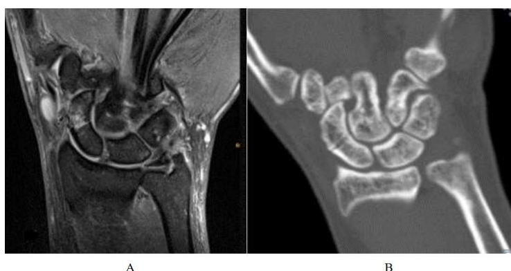
Figure 1. A case of Fracture waist of scaphoid bone. Male patient 56 years old presented with painful swelling at the radial side of right wrist joint after acute wrist trauma A. Non-enhanced MSCT scan of right wrist joint Transverse non united fracture line at the waist of scaphoid bone (black arrow). B. MRI of right wrist joint The STIR images demonstrate significant bone marrow edema denoting recent fracture (white arrow).

Showed that there was no difference between findings of MRI and CT results as regards the stages of Scapho-Lunate advanced collapse (SLAC wrist). (Figure 3)