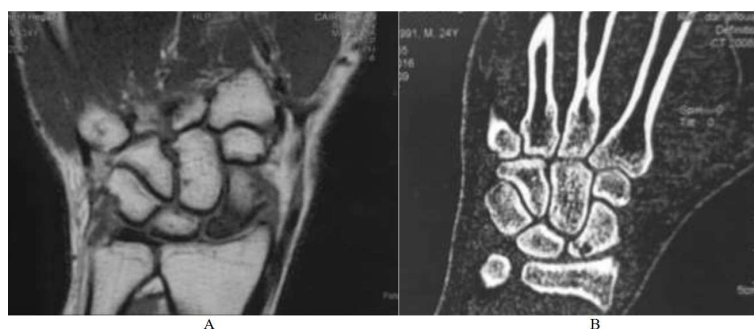
Figure 2. A case of Fracture proximal pole of scaphoid bone with AVN grade II. Male patient 25 years old presented with pain and swelling at radial side of right wrist joint A. Non-enhanced MSCT scan of right wrist: Non-united fracture line is seen in proximal pole of scaphoid bone (black arrow). CT evidence of sclerosis of the proximal pole of scaphoid bone... AVN grade II. B. MRI of right wrist joint: Non-united fracture line is seen in proximal pole of scaphoid bone (white arrow) Areas of marrow edema along the fracture line, hypointense lines in the proximal pole of scaphoid bone denoting sclerosis but less are significant than MSCT.