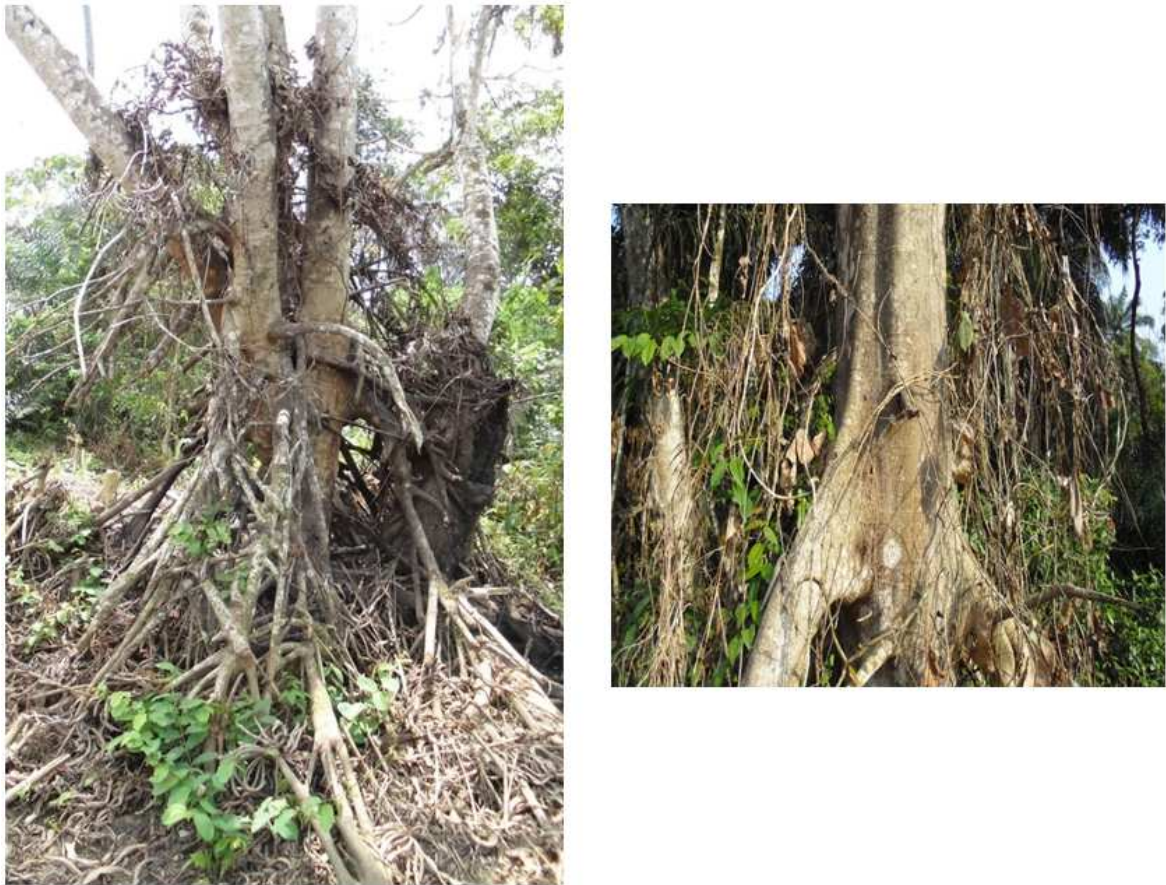
Fig. 3: Buttress roots of Musanga , a wetland adaptation feature