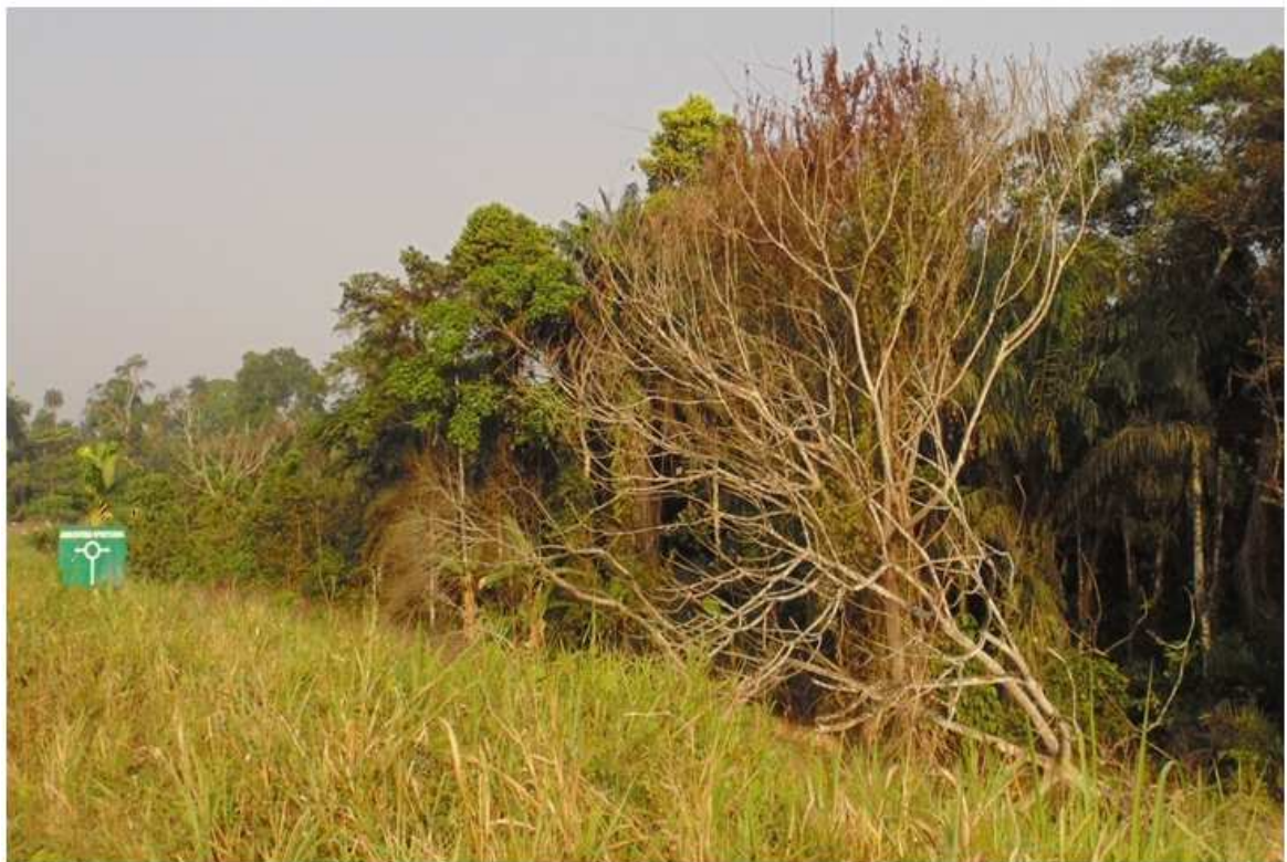
Fig. 4: Notice dead Musanga species while other vegetation in the fore ground and background are healthy