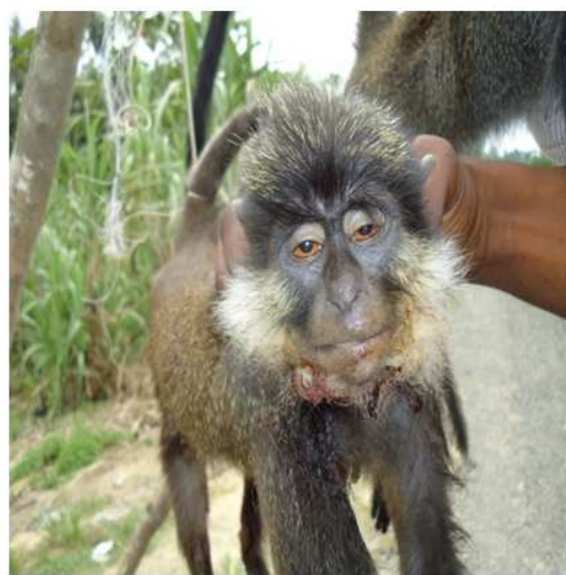
Fig. 1: Monkeys displayed for sale along the Wilberforce Island road before the flood

The ecosystem of Niger Delta is dominated by evergreen plants (trees), shrubs and herbs which belong to several families that share common habitat preference, physiognomy, function and structural adaptation [16]. The ecosystem of this wetland is frequently affected by several activities emanating from decisions that place alternative land use as a priority. The recent flood destroyed the natural rainforest ecosystem resulting to the loss of wildlife and vegetation. The major families of Wilberforce Island vegetation include Annonaceae, Potaliaceae, Lamiaceae, Moraceae, Portulacaceae, Solanaceae, Costaceae, Asteraceae, Myrtaceae, Araceae, Malvaceae, Marantaceae, Poaceae, Curcubitiaceae, Fabaceae, Rutaceae, Anarcadiaceae, Clusiaceae, Vapaceae, Apocynaceae, Irvingiaceae, Arecaceae (Palmae), Potaliaceae, Mimosaceae, Melastomataceae, Oleandraceae, Amaranthaceae, Tiliaceae, Verbenaceae, Dioscoreaceae, Euphorbiaceae, Caricaceae, Convolvulaceae, Musaceae, Lauraceae, Rubiaceae, Burseraceae, Asteraceae and Urticaceae (Moraceae). Wilberforce Island is characterized by five distinct vegetation/land use types which include forest reserve, home gardens, riparian forest, bush fallow and farm plots. The forest has stratified layers of shrubs and herbs comprising an upper and lower storey. The riparian