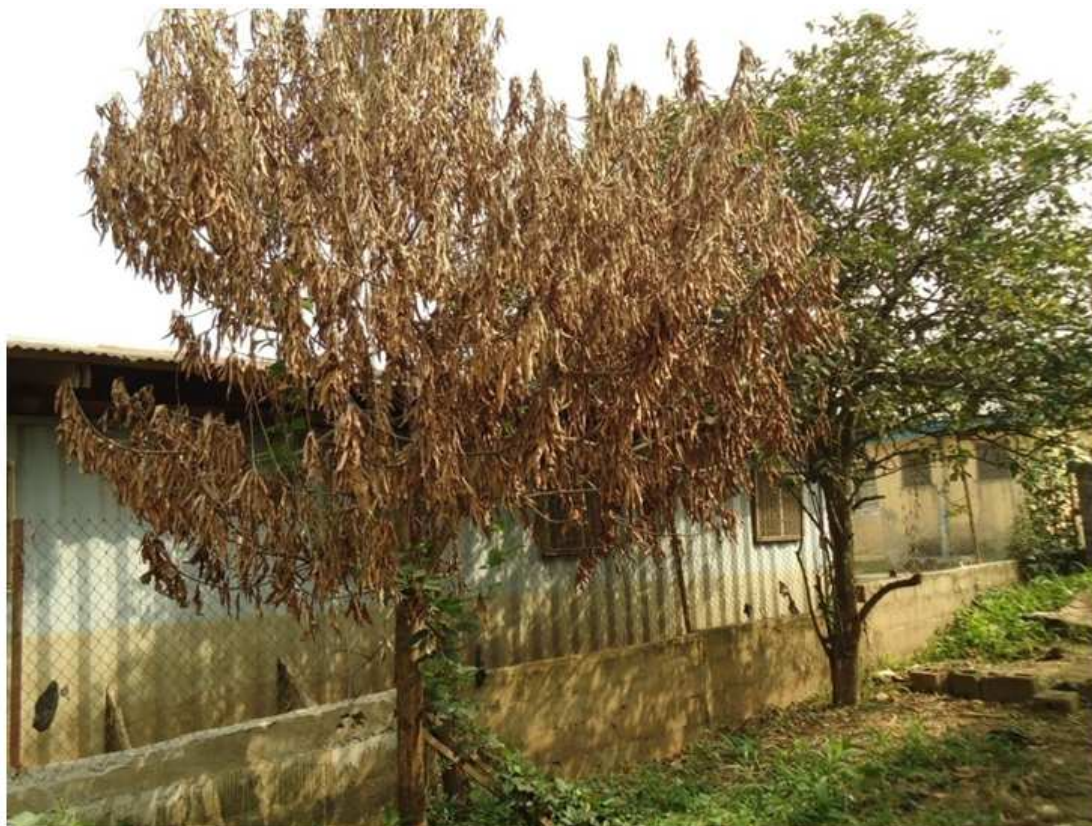
Fig. 2: Selective impacts of the water flooding on vegetation (notice dead mango on the left side, whereas orange on the right is healthy side; also observe the height of the receding water marks on the wall of the building at the background)

Majority of the impacted fauna are source of protein to humans, while the flora is a source of food and timber. Majority of the fauna impacted are of least concern [33]. The water level was quite high, submerging most shrubs and herbs. However, the study found out that despite some trees such as Musanga cecropoides having adaptation to wetland conditions, was the hardest hit by the flood. Also, the impact on plant were selective because Mangifera indica were also observed drying up whereas, Citrus sinensis that were found in the same area where flourishing after the floods.