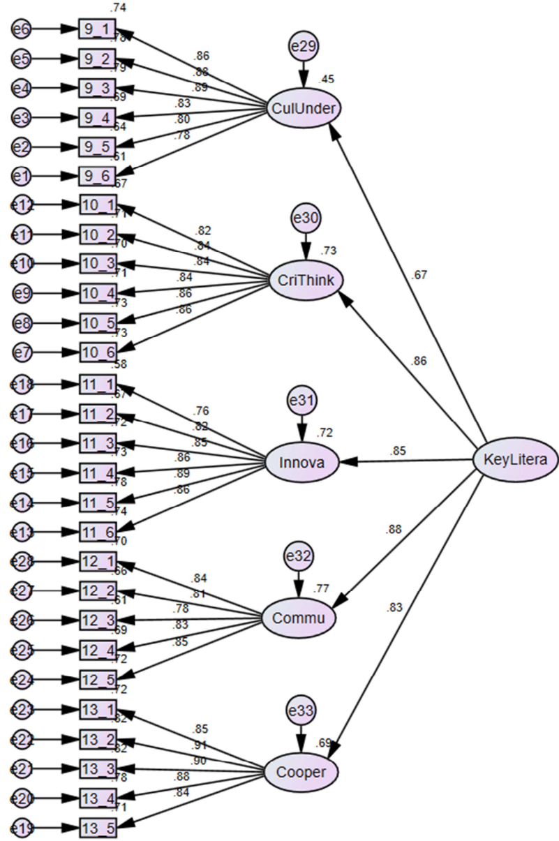
Figure 2. Structural equation model of key literacy.