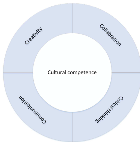
Figure 1. 5C model of key literacy in the 21st century.

to question their own views. "Innovative literacy" reflects that students can use relevant information and resources to produce new and valuable ideas, programs, products and other achievements. "Communication literacy" reflects that students can effectively communicate information, thoughts, emotions and values with others or groups by using verbal and non-verbal media, so as to achieve specific communication goals. "Cooperative literacy" reflects that students can actively undertake the responsibilities within the group and negotiate with team members on an equal footing on the basis of agreeing with the goals and core values of the group or team, and achieve common goals [11-15]. This study takes this model as a reference to evaluate the development of students' key literacy.