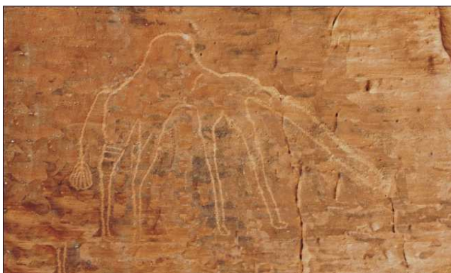
Figure 3. Tribal symbol marked on the hind leg.

Domesticated camels are also marked with animal brands or locally called as Wasum. A Wasm is not only a camel brand but is a tribal symbol used also as territorial mark, land ownership sign, camping areas on swords, knives and tents. A Wasm or tribal sign is restricted to a specific tribe and cannot be used by others. It is depicted on a specific part of the body and all members of the tribe, clan or families adopted the same method (figure 3) By following the Wasum depicted on the rocks tribal movement and their camping sites could be traced [12]. Sometimes several tribal symbols are densely located on a rock (figure 4) that indicated the tribes of each depicted symbol either camped or lived in that area.