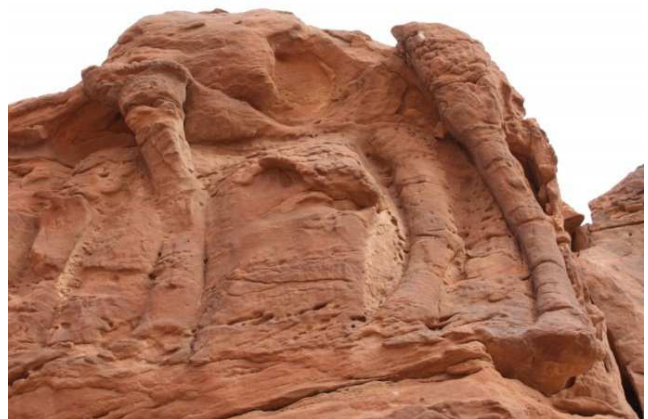
Figure 7. So called Al-Jawf camel sculpture with three legs; one of the front leg, hump, neck, face missing. They say these parts are eroded.

The individual camel figure is huge located up high on a small hill not easily accessible without a ladder or any support. There are no signs of cutting, chiseling, carving, engraving or pecking. Charloux et al (2008) did not publish the full picture of the out crop that can be seen in my picture (figure 7). To associate the camel figure with the goddess AL-Lat is also erroneous as Charloux claim, not a single figure of AL-Lat found anywhere near al Jawf or area around it. Charloux later attributed the site to Neolithic but he did not contradict about AL-Lat statement.