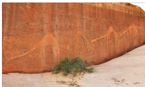
Figure 1. Camel figures depicted in a row with tribal symbols and ancient inscriptions, near Tayma western region.

bushy eyebrows protect them from the blowing sand. Their mouth, lips and jaws are external hard and tough and allow them to eat anything from thorny plants to dry desert bushes, bones, salty or sweet hard or soft, its stomach has no limitations and it can digest anything that he eats [16].