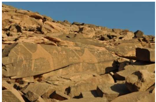
Figure 6. Camels of various period and Wasum.

There is no clear evidence about the domestication of camel in Africa or Arabia. The archaeological record on camel is sparse and incomplete. Camel bones have been recovered in excavations of a tumulus at Himma, southern Arabia; also its