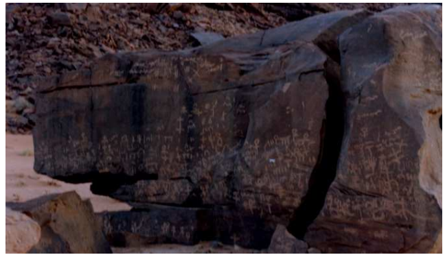
Figure 4. Several tribes marked their symbols on Camping sites. A process of several centuries.

were found in wild state as well as domesticated specie. This is puzzling, how horse riders are shown hunting camels in the desert while there is no evidence of their presence in the wild state in Arabia. In the old days, if the camel was lost in the desert and moved far away it would not have been possible to find them. Such camels lived deep in the desert at inaccessible places, grow wild and increased in number. Thus, in the rock art horse riders are shown hunting such wild camels (figure 5).