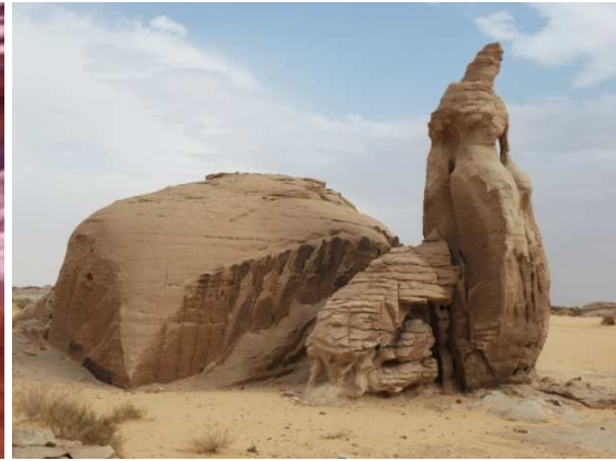
Figure 9. Example of art of nature located at Mosses Beautiful standing lady at Tayma, northwest of the country.

In Sinai at the base of Jabal al Musa, this art of nature is taken by the people as a cow of Moses, local Bedouin girl took us to the site and said it is the cow of Moses. Sometime people come here and worship her. This is certainly not man-made cow but is the art of nature just like al-Jawf camels created by nature. The standing graceful lady located southeast of Tayma, northwest of the country is an excellent example of art of nature.