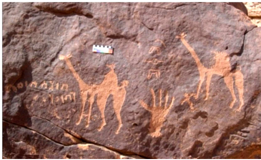
Figure 2. Camel figures associated with the names of their owners written in pre-Islamic Thamudic script.

of the Arabian Peninsula (Figure 1). Although rock art practice was almost abandoned with the invention of writing in Arabia, camel and horse figures were still depicted in association with ancient Arabian writings such as Musnad al Janubi, Thamudic, Lihyanaite, Nabataen (figure 2). In many cases name of the owner was written besides the camel figure that survive for long and a record of the names of ancient Bedouins and their tribes are preserved on the rocks and hills providing insight of Bedouin nomenclature and their tribal affinity [7, 11, 15].