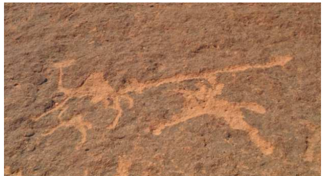
Figure 5. Hunting wild camel.