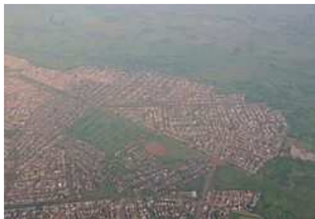
Figure 5. Aerial View of Vosloorus Township.

The study took place in Vosloorus, which is situated east of Katlehong and Alberton. The three primary schools where the study was conducted are considered to be Quintile 3 schools, also known as “no-fee schools”. These schools cater for three phases, namely the Foundation, Intermediate and Senior phases. Enrolment at each of the schools is just more than 1 000 learners. The home languages (HLs) taught in these schools include Sesotho, IsiZulu and Northern Sotho.