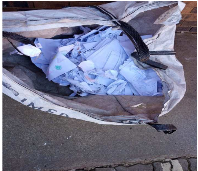
Figure 4. Recycling of white paper at school C.