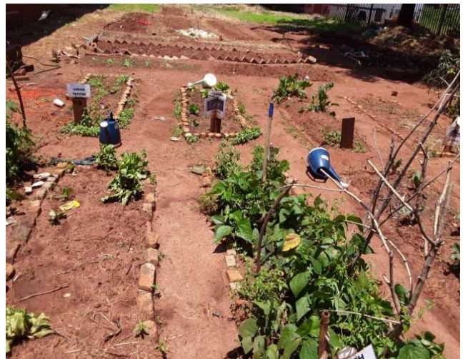
Figure 3. Using watering cans to irrigate crops at school A.