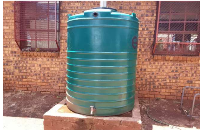
Figure 2. Water tank used to store water to irrigate crops at school A.

This paper followed action research design. Dick defines AR as a method which seeks to combine research and action, with a view to spurring change or bringing about some kind of community transformation [5]. This researcher chose to do AR into how EE is implemented in township schools, given evidence of poor environmental management in the greater Vosloorus. To that end, the researcher worked with teachers, learners and parents, to mitigate existing environmental problems in the immediate vicinity of the schools and surrounding areas. Action took on the form of campaigns that included cleaning the terrain, fixing dripping taps, and conserving water by using rainwater collected in buckets, water tank (jojo) and watering cans, to irrigate crops and recycling of white paper.