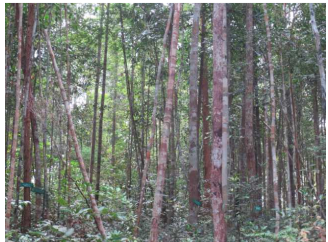
Figure 3. Protected forest in Lapak Jaru area for biodiversiy conservation (flora and fauna).

On the other hand, that the existence of TAHURA Lapak Jaru is related to the Medium-Term Development Plan (RPJM) established by the Gunung Mas Regional Planning and Development Agency ( Bappeda ) in maintaining the balance of the environment and the social economy as follows: 1) conducting conservation in water catchment areas