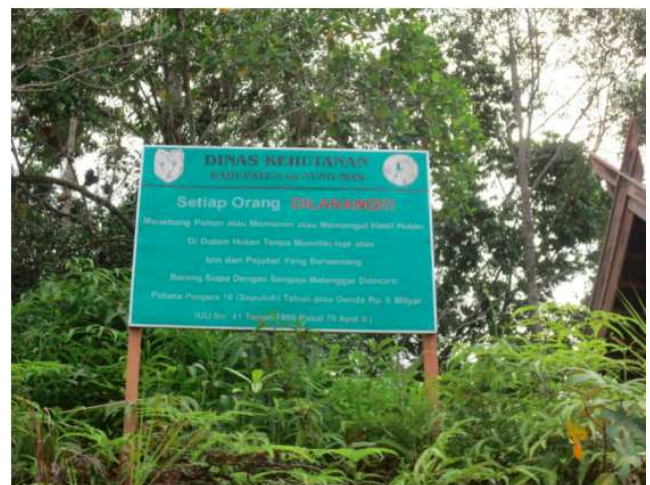
Figure 2. Lapak Jaru cite appointed as Tahura area in Gunung Mas District. Source: (individual photo), May, 2015.

illustration, the designation of customary forest covering an area of 5,010.96 hectares is designated as 'protected forest' to be created 'People Forest Park' (Taman Hutan Rakyat/TAHURA) based on an environmental impact analysis study ( Amdal ) (Figure 2). The idea for the formation of Tahura was invited Pro and contra. Among the party of pro was initiated by Hambit Binti, former Regent of Gunung Mas (2001-2014), province, central government and NGOs engaged in conservation (WWF, USAID-Lestari, Walhi, Telapak, etc.) for water catchment, conservation of flora and fauna biodiversity (Figure 3). This is related, because the location of Lapak Jaru is very strategic in the upstream river sources, including the Kurun, Sepan, Dajung, Panakon, Bahandang and Bahenas rivers.