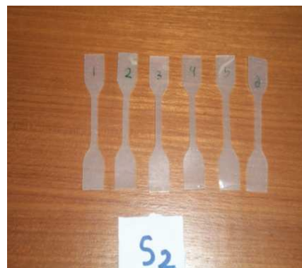
Figure 1. Sampel for tensile test with a mixture of PVA and ZnS nanoparticles (PVA: ZnS); S1 (100:0)% and S2 (99:1)%.

Shown in Figure 1.variation of each sample was made 5 pieces to get a more accurate result and the results averaged measurements taken. Sample S1 with only PVA (ZnS nanoparticle 0%) have clear and transparent colors. Sample S2 with a mixture of PVA and variations ZnS nanoparticles (99:1)% has a white color somewhat darker than the sample S1. With a mixture of 1% ZnS nanoparticles have shown differences in terms of color samples, as well as for samples with a mixture of PVA and ZnS nanoparticles (98:2)%, (97:3)% and (96:4)%. They have more white color and not transparent. This is due to the amount of nanoparticles are mixed more and more.