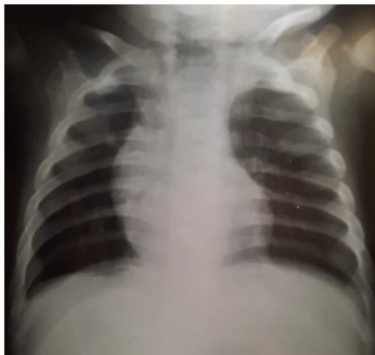
Figure 2. Chest x-ray showing a normal cardiac silhouette; cardio-thoracic index at 0.48.

He was polypneic at 40 cycles per minute and saturated at 78% on room air. He was tachycardic at 132 beats per minute, the peak shock was palpable at the apex. There was a diffuse systolic murmur heard at the level of the epigastrium, the other devices were without abnormalities. Her chest radiograph showed a normal manubrium-sternum and lungs, with a displaced cardiac shadow (Figure 2).