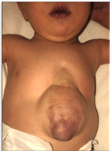
Figure 1. A thoraco-abdominal large defect measuring 10 \times 6 cm.

weight was 6 kg normal for his age. He had an obvious lower chest wall abnormality, the heart is visible at the epigastrium with a large omphalocele measuring 10 \times 6 cm, extending to the epigastrium, covered by a thin membrane. No other congenital malformations were detected. (Figure 1)