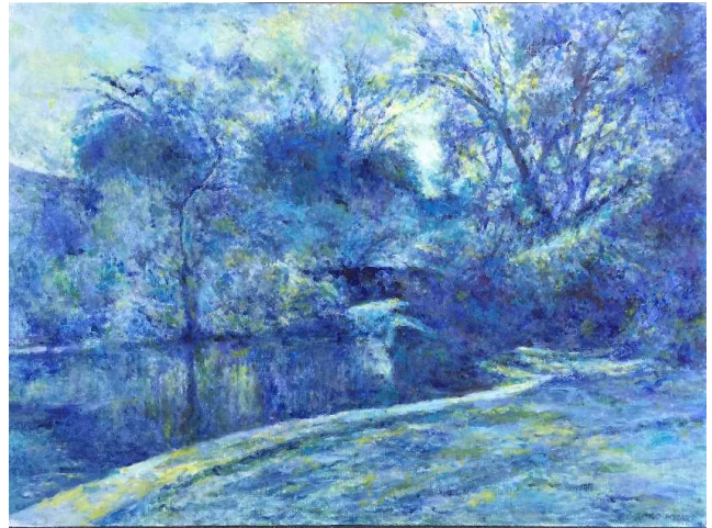
Figure 2. English Countryside by Leslie Bernard Wynne Oil painting completed during what family referred to as "the blue period".