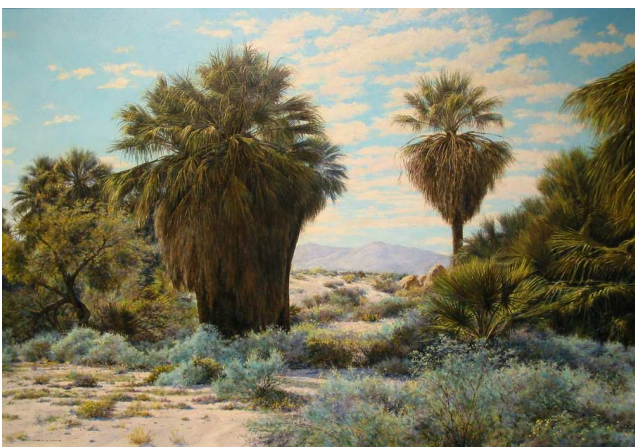
Figure 1. Oasis of Mara by Leslie Bernard Wynne Oil painting completed at height of career.