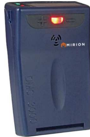
Figure 4. DMC 3000 Electronic Radiation Dosimeter.

The DMC 3000 Electronic Dosimeter is a great fit for almost any application where a live indication of both total radiation dose and dose rate is needed. It protects workers who are exposed to radiation by notifying them of changing levels of radiation exposure with ultra-bright LEDs, audible alarms and vibration (figure 4). [14]