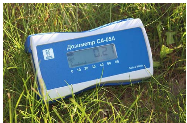
Swiss dosimeter SA-05A.