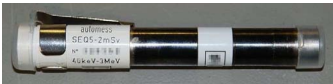
QFD - These are now largely superseded radiometer-dosimeter (Front view).