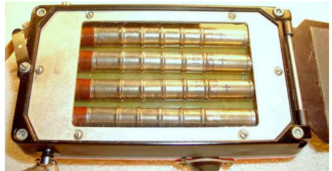
Russian Sosna radiometer-dosimeter (Rear view) Soeks 01M.