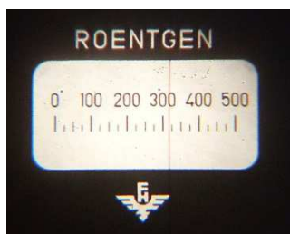
View of QFD reading.