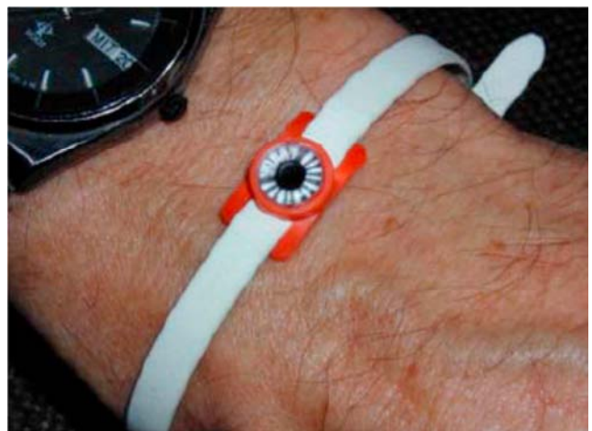
Figure 1. Thermo Scientific™ DXT-RAD Extremity Dosimeter.