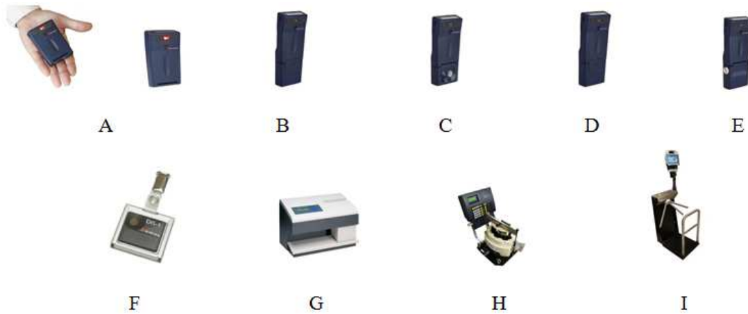
Figure 5. A: DMC 3000 Electronic Radiation Dosimeter, B: DMC 3000 PRD Module, C: DMC 3000 Beta Module, D: DMC 3000 Neutron Module, E: DMC 3000 Telemetry Module, F: DIS Dosimetry System, G: TLD Dosimetry System, H: Dosimeter Calibrators, I: Access Control Hardware.