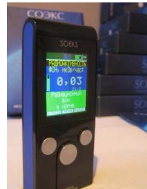
Russian Radex RD1503.