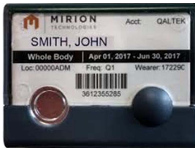
Figure 7. The Genesis Ultra Dosimeters.

The Genesis TLD Dosimeter line offers improved performance and superior user factors. This dosimeter responds accurately to beta, gamma, X-ray and neutron radiation. The response of each element is adjusted by the application of its own unique correction factor. These dosimeters report deep dose, lens of eye and shallow doses. Unlike other TLD products, the Genesis Ultra TLD has virtually no fading characteristics. Due to the increase in signal response a minimum reportable dose (MRD) as low as 1 mrem (0.01 mSv) is available, compared to the 10 mrem (0.10 mSv) MRD of other TLD products (figure 7) [17].