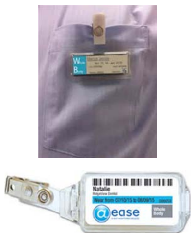
Figure 8. The Genesis Ultra and The APex TLD Dosimeters.