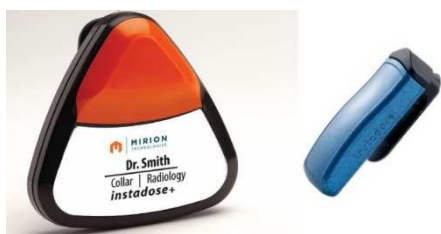
Figure 6. Instadose+ and instadose 1.