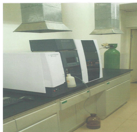
Fig. 1. Atomic Absorption spectroscopy (AAS).

Atomic absorption spectrophotometer was adjusted to zero point by using deionized water. Absorption of the standard lead (II), cadmium (II), nickel (II) and chromium (III) solutions were measured and recorded automatically by the instrument. The absorption of RPWW before and after passage was measured and recorded. The concentrations of heavy metals in samples were determined directly [7] by using AAS shown in Fig1.