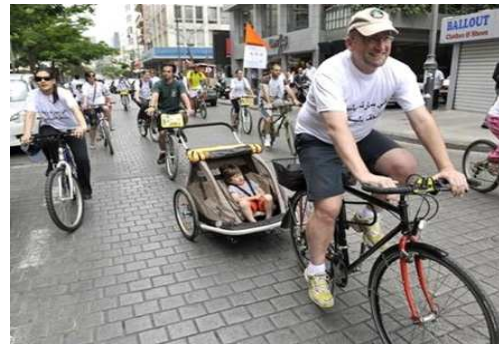
Figure 20. Bike lane as a major transport facility.