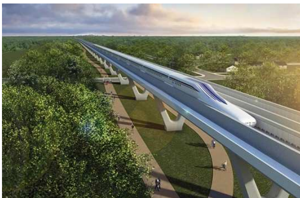
Figure 11. 300 MPH Maglev Train.