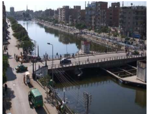
Figure 17. Shebeen El Kom, Egypt.

The aim of the project is to promote the use of non-polluting, non-automotive means transportation (such as bicycle and pedestrian transportation) in certain traffic hubs of Shebeen El Kom. It also aims to provide bicycle parking space and to encourage the university and a number of companies to sell bicycles to students and employees at easy payment terms. Moreover, the project aims at encouraging university graduates to set up bicycle repair shops and at implementing some of the activities included in the National Campaign to Encourage Bicycle and Pedestrian Transport in Al Menoufeya Governorate, specifically in the city of Shebeen El Kom 19 .