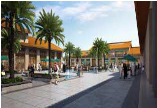
Figure 7. internal pedestrian walk way.

The temptation to beautify pedestrian and automobile passages is important in the planning and design of pedestrian lanes. Great care must be taken in the positioning of plants and trees on roads; they must be planted in the right spots to perform the right function. Trees and bushes may be planted on passages that are largely reserved for pedestrian use. However, planting trees on the sides of highways or in the median strips separating two-way streets is not recommended. In fact, trees in the middle of highways can be the cause of some of the worst types of road accidents when automobiles crash into them 12 .