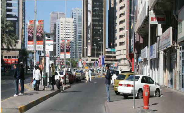
Figure 12. Parking location, pedestrian crossing old statues.

Providing additional space for street fixtures, then reducing the width of the side barrier to a distance of between five and three meters from the pavement