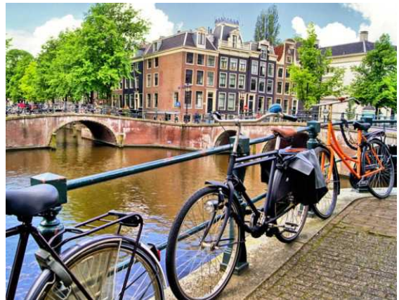
Figure 6. Bike Lane.

Policies aiming at encouraging the use of public transport over automobiles in congested areas