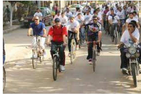
Figure 19. Using a Bike Lane with the road design.