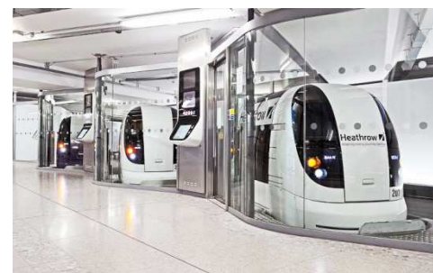
Figure 9. super personal electric transport pods.