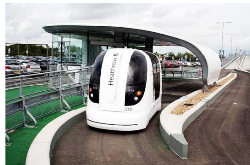
Figure 8. super personal electric transport pods.

Milton Keynes, a small city north of London, has just announced plans to install one hundred automated "pod cars" to run between the city's central station and the city center. These ULTRA Personal Electric Transportation Pods will travel along the platforms, at speeds of up to 12 miles per hour. The project, which costs 104 million USD, is part of a five-year pilot plan expected to be completed in 2017 15 .