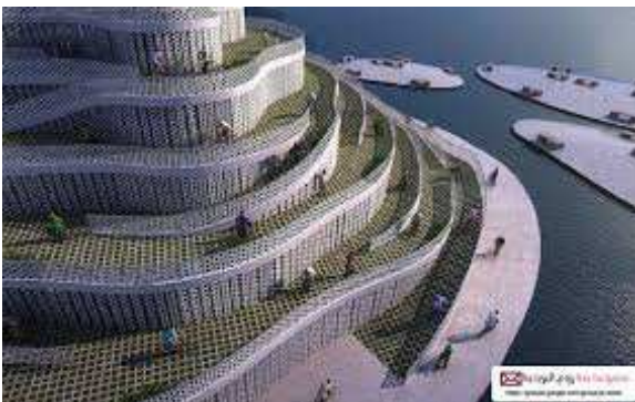
Figure 5. Pedestrian Paths.

This is the place reserved for pedestrians on motorway sidewalks; paths reserved only for pedestrians where there are no trees, overhangs, pillars or dangerous obstructions. They should be fit for use by pedestrians as well as by the physically impaired. Pedestrian paths (sidewalks) must be at least 1.525 meters (60 inches) wide, to allow two people to walk side by side. Depending on population density, sidewalks in commercial sectors and similar places may be wider 11 .