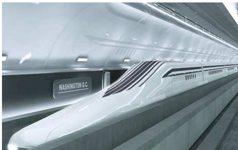
Figure 10. 300 MPH Maglev Train

Source: Green Transportation - powered by Feed Burner_file -O'flanerty, C. A.: Highway Traffic, 2012