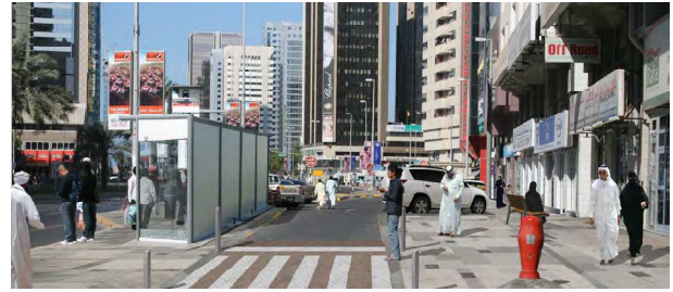
Figure 13. Parking location, pedestrian crossing new.