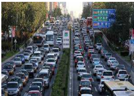
Figure 2. Traffic congestion in Eastern Cities.