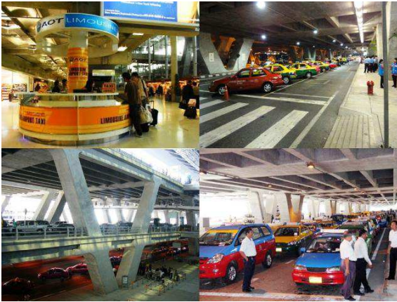
Figure 4. Parking types and spaces

Canberra: Department of Infrastructure and Transport