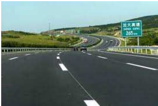
Figure 1. High way Roads

ports and airports, account for a further 5%2.