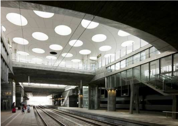
Figure 3. Train station in eastern cities