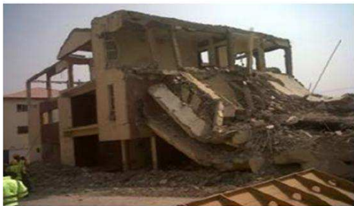
Figure 2. Collapsed Naval building in Gwarinpa, Abuja, Nigeria [4].