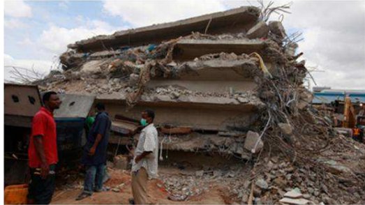
Figure 1. Collapsed Synagogue building in Nigeria [5].

buildings that had outlived their life spans, some were still undergoing construction, some had been declared unsafe and undergoing demolition while others were already completed and in use when the sudden collapse occurred. Figures 1 and 2 show some of the collapsed buildings in Nigeria.