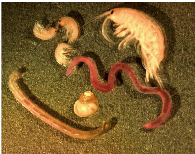
Figure 1. Variety of benthic macroinvertebrates viewed under a stereo microscope.

coelentrates etc. [2]. The organisms are also found dwelling in or on filamentous algae for some part of their life circle [3]. Different types of macroinvertebrates tolerate different stream conditions and levels of pollution. Their presence or absence are commonly used as indicators of the biological condition of water bodies to indicate clean or polluted water; long enough to reflect the chronic effects of pollutants, and yet short enough to respond to relatively acute changes in water quality.