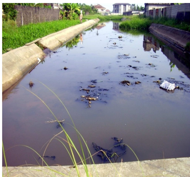
Figure 3. Station 1—showing the Upstream part of the study Area (Abacha axis).