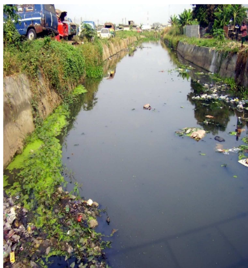
Figure 5. Station 2-showing the Upstream part of the Study Area (Okija axis).