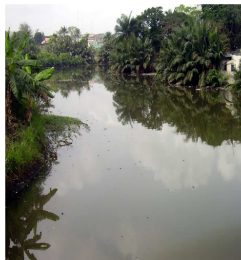
Figure 8. Station 3-showing the Downstream part of the Study Area.