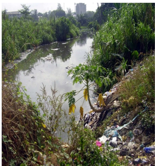
Figure 7. Station 3-showing Upstream part of the Study Area (Eastern-Bypass).