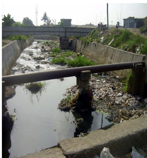
Figure 6. Station 2-showing the Downstream part of the Study Area (Okija axis).