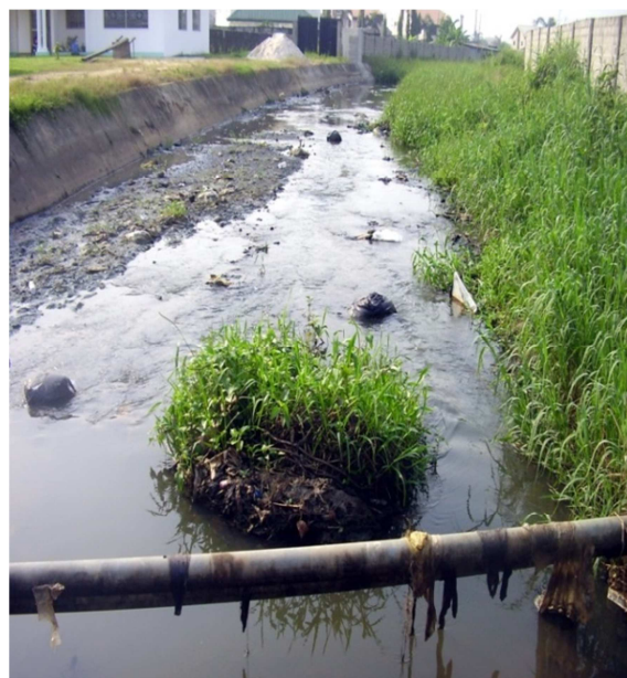
Figure 4. Station 1—showing the Downstream part of the Study Area (Abacha axis).