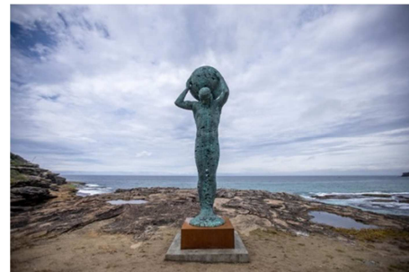
Figure 5. Egor Zigura, Colossus Holding the World . Sculpture by the Sea, Bondi 2022–2023.