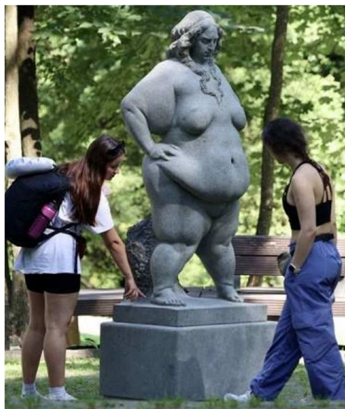
Figure 1. Vasyl Korchovyi. Confident. 2021. Granite. Park exposition of the mobile exhibition in Lviv 2023.

things and especially works of art results in a form of sensual eternalism, when art is understood only as something that represents this or that form of "reality", be it the reality of concepts produced by our mind to describe the world we live in or the so-called "physical reality" of dense material objects or any other given, particular, defined form of reality, as opposed to Transcendental Reality as such.