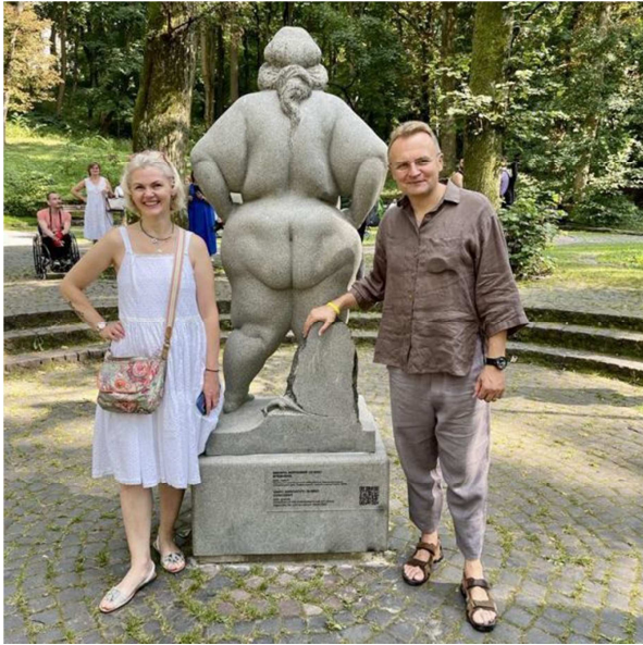
Figure 2. The mayor of Lviv Andriy Sadovy with his wife near the reverse of the sculpture "Confident". 2023.

deformations of the body, which should not be hidden with children being allowed to get used to such transformations reflected in public art; finally, there were those who claimed to have liked the artwork while declaring that in life they adhered to the traditional formula "a healthy mind in a healthy body".