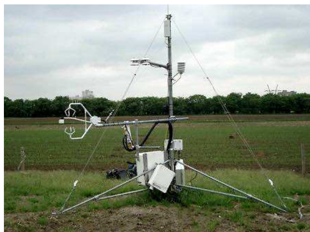
Figure 1. Precision Farming Experimental Field of the Timiryazev Agricultural University situated in Moscow. President of Russian Federation will protect this site from attempted raider seizure.

soils), but both with the same land use: the both fields were under barley.