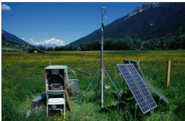
Figure 3. Neustift/Stubai Valley FLUXNET tower site.

Modeling carbon dioxide and other green house gases (GHG) budgets at the local, regional and global scale is a fundamental task for understanding the current and future behavior of the climate cycles and to work out strategies in the decision making for sustainable development [1]. Mathematical models are effective and often the only available tools and instruments for testing the claims of GHG emission reduction. Building adequate models, especially in the presence of complex phenomena such as turbulence is a big challenge [2]. Further complications may be introduced by the variability of flows in mixed landscapes, by the physical aspects in measuring covariance of flows and complex atmospheric layer dynamics, as well as the problem of interpretation, gap filling, footprint identification and date aggregation. Therefore, despite the fact that many investigators are producing estimates of annual carbon exchange, it is imperative to clarify and to account for the key limiting factors imposed to the eddy covariance method. For example, well written just recently published book by Dr. George Burba [3], as well as his previous multiple publications, as an instrumental introduction to the subject and a thorough collection of useful state of the art articles [4] introduce simplified “Eddy Flux” as a product of the averaged air density and correlation term (time-averaged product) between fluctuations of the vertical air velocity and