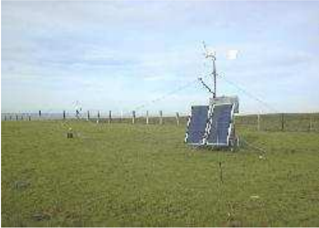
Figure 2. Polden- Scotland FLUXNET tower site.